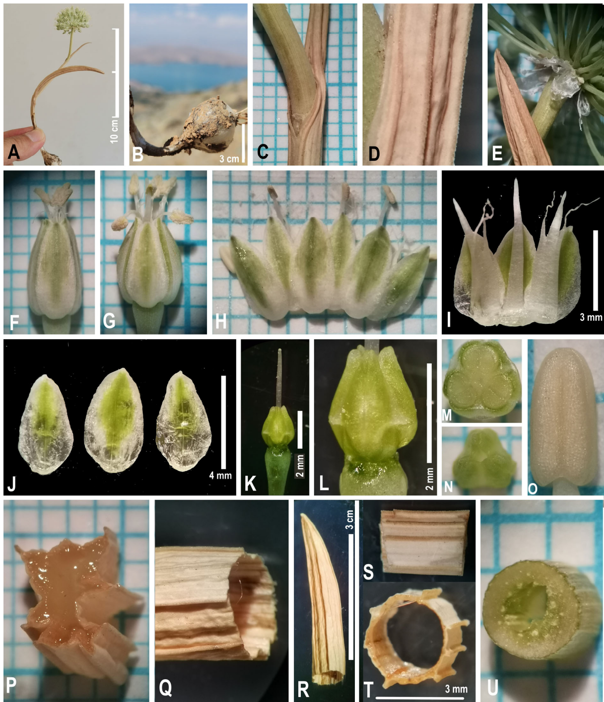
Figure 2. Allium decumbens (from holotype); A: Habit, B: Bulb, C: transition from leaf sheath to lamina, D: Leaf sheathing. E: Bracteoles and apex of lower leaves, F–G: Perigone, H: Outer surface of open perigone with stamens, I: Inner surface of open perigone, J: Outer-inner-outer tepal, K–L: Ovary, M–N: Cross-section of lower and upper part ovary, O: Anther, P: Lower part of lower leaf, Q: Cross-section of leaf, R: upper half of the lower leaf, S: Leaf sheathing, T: Cross-section Leaf sheathing, U: Cross-section of scape.