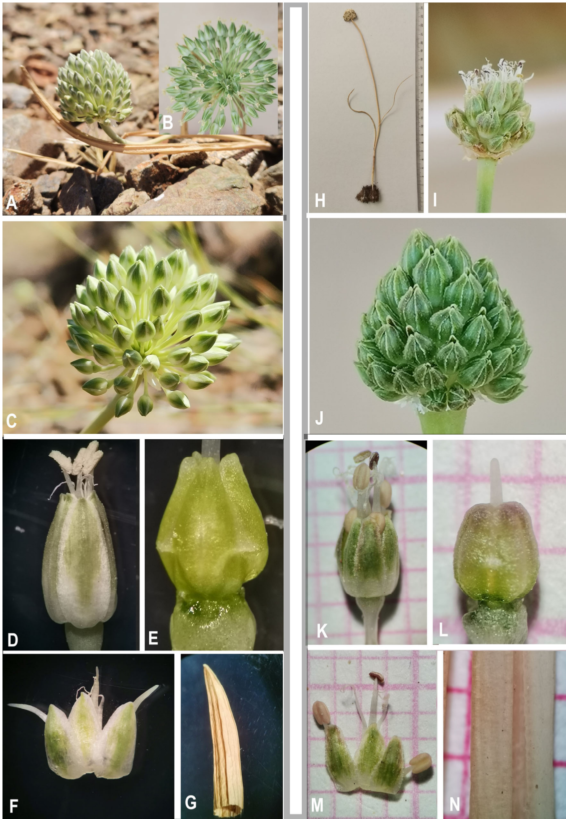
Figure 3. Comparison of some different morphological parts of Allium decumbens and Allium murat-sonayii with photographs. A. decumbens (from holotype); A: Habit, B–C: Umbel, D: Perigone, E: Ovary, F: Outer and inner tepal, G: Cross-section of leaf, A. murat-sonayii , H: Habit, I–J: Umbel, K: Perigone, L: Ovary, M: Outer and inner tepal, N: Cross-section of leaf.