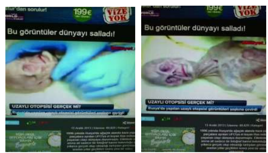
Figure 10. According to the newspaper's claim, theese images about alien autopsy

Headline: These Images Shook the World (Video News)