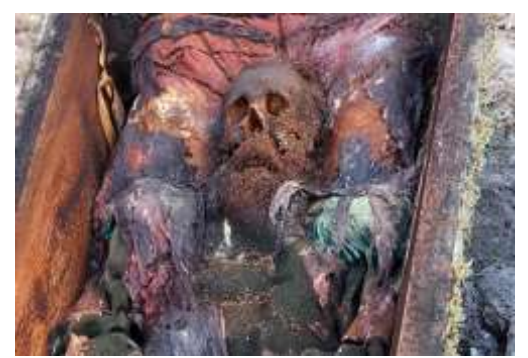
Figure 3. Russian General's body

Headline: Mysterious Events in the Neighborhood Where Russian General was Found.