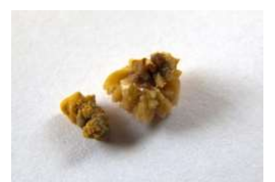
Figure 1. According to newspaper's claim kidneystone which passed by some vegetables

Headline: Interesting Method to Pass a Kidney Stone (Gallery News of 5 Pages).