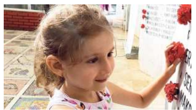
Figure 7. Child aggrieved from earthquake

5.3.2. The Newspaper "Milliyet" (18.08.2017) Headline: a 7.2-magnitude earthquake will happen