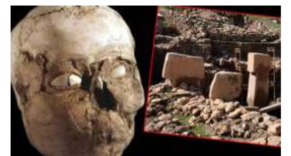
Figure 4. Archaeological provenances from Göbeklitepe

Headline: Breaking News: This could be the first-ever! It was found in Şanlıurfa, its secret revealed.