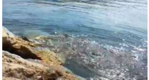
Figure 6. Some abnormalities in the sea after earthquake

5.3. Geology News 5.3.1. The Newspaper "Hürriyet" (14.06.2017) Headline: This view happened after