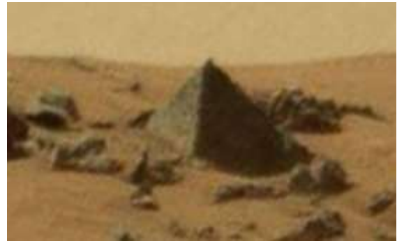
Figure 11. According to the newspaper's claim, that Pyramide photo from Mars

5.4.3. The Newspaper "Habertürk" (24.06.2015) Headline: This photograph from Mars!