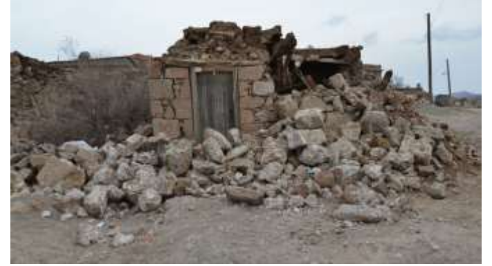
Figure 8. Ruin house from earthquake

Analysis: When the content of the news item is reviewed, it is found out that Prof. HalukÖzener, director of Boğaziçi University -The Kandilli Observatory and Earthquake Research Institute, expresses 5/5.5-magnitude earthquakes occurred in Çanakkalein the recent days can be regarded as normal, there is no abnormality as well as answers the question "Are these small earthquakes a sign for a bigger earthquake in the Aegean Region" with the statement "It is not possible to say anything like that". However, the headline of the news item is presented with a speculative and tabloidized discourse, as if the date and the magnitude of the next earthquake were certain. The image used in the news item is a photograph describing a house that appears to be completely ruined and devastated. It is unclear on which date and where the earthquake that led to the devastation of the house in the image occurred. It is even unclear whether the image is associated with an earthquake. The only thing that is clear is that the image used supports the psychology of fear and the negative effects created by the headline "Big Earthquake".