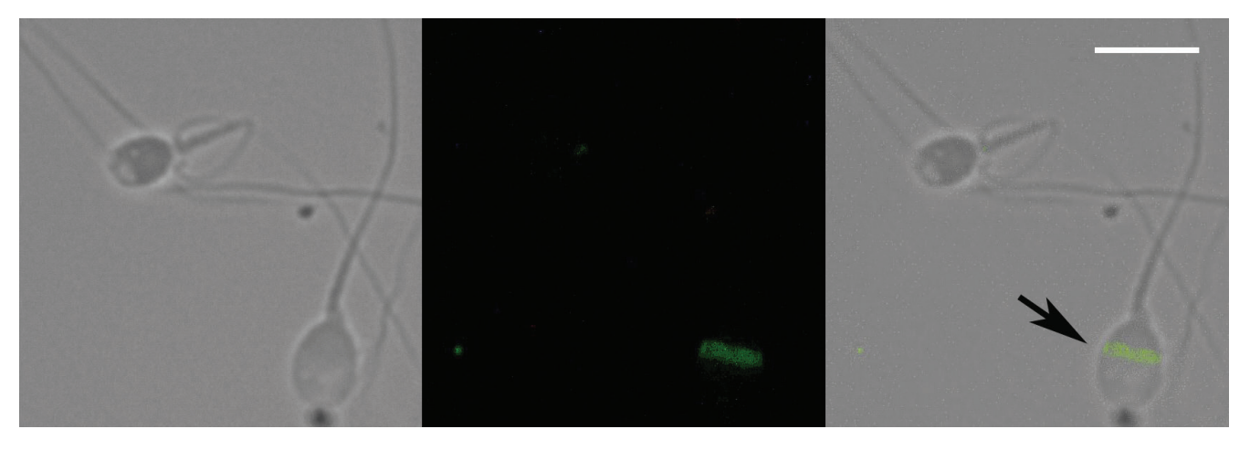
Figure 1. On the left side light microscopic, on the center fluorescent microscopic, on the right side merged micrographs of two sperms. One PLCZ positive stained (arrow) and one negative sperm. Scale bar represents 5µm

Out of 16 patients that agreed to participate in the study; the density gradient washing technique was applied to the semen samples of 11 patients, which fulfilled study criterias, which are as sperm concentrations of 10 \times 10^6 /ml, motility of >30% and a normal morphology of >1% (Table I). In the light and fluorescent microscopic examinations of the PLCZ staining; parameters such as proportions of sperm exhibiting PLCZ immunoreactivity, the staining localization and the staining intensities could be clearly assessed (Figures 1 and 2).