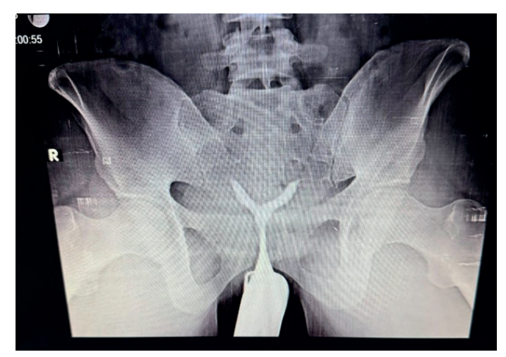
Figure 1. Preoperative hysterosalfingography image

a transverse incision in the lower segment and a single fetus weighing 2805 grams was born.