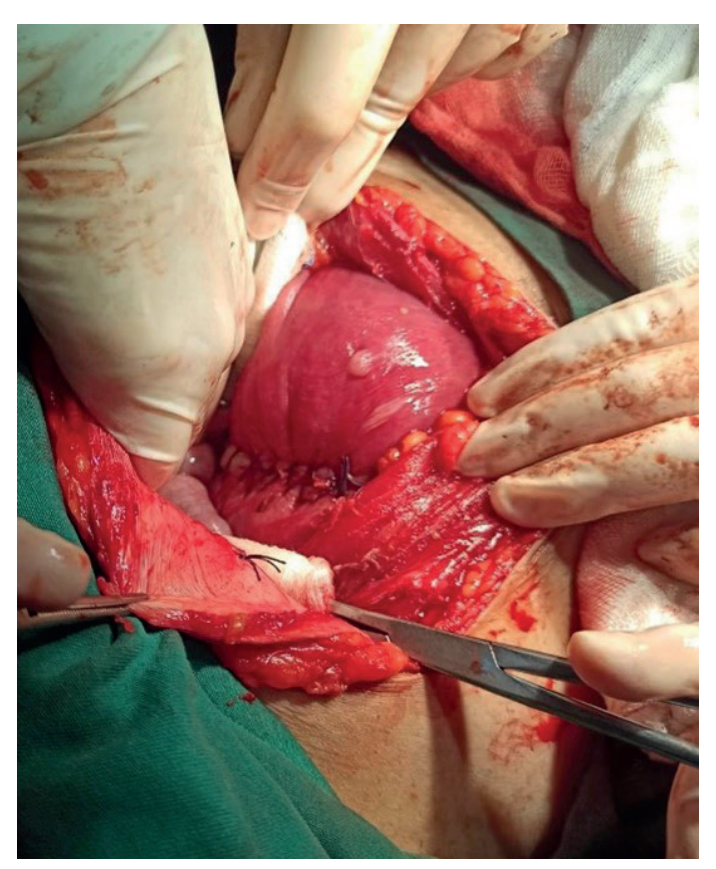
Figure 3. Image of the ruptured area after repair

can include uterine perforation during surgery, hemorrhages, development of intrauterine adhesions after surgery and uterine rupture in subsequent pregnancies. Although rare, uterine rupture can be fatal if not recognized in time.