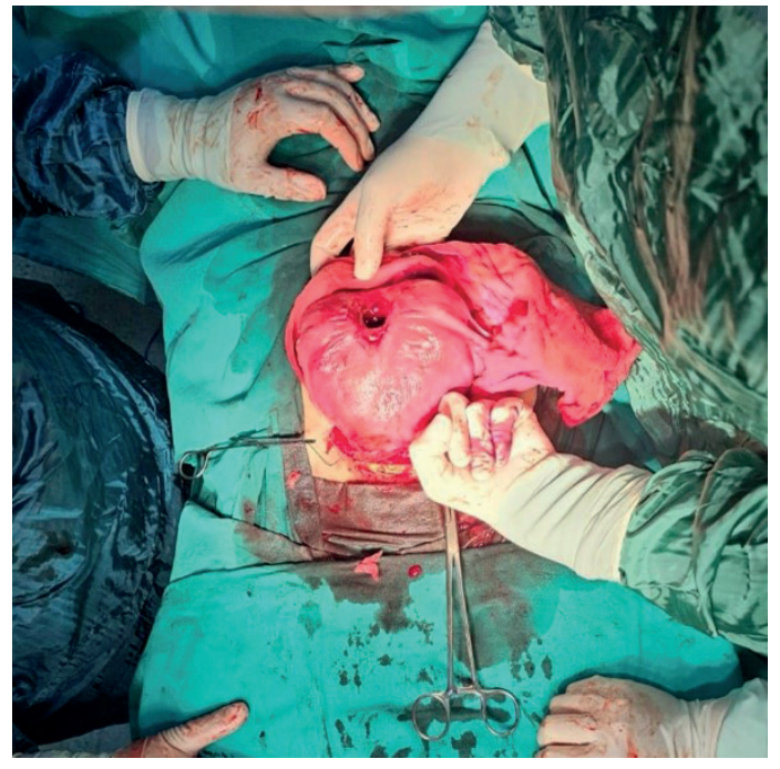
Figure 2. Image of the rupture area before repair

Rupture of uterus during pregnancy poses significant risks to both the fetus and mother, with high mortality and morbidity rates. Hysteroscopic procedures such as septal resection are also known risk factors for uterine rupture in subsequent pregnancy. The 2010 statement from the National Institutes of Health (NIH) Consensus Development Conference reported no maternal deaths due to uterine rupture (7) but a 10-year review of severe maternal outcomes in Canada reported four maternal deaths among 1879 cases of uterine rupture in patients with no major preexisting medical conditions (8). While awareness of the prevention of uterine rupture following cesarean section has increased, not enough attention has been paid to cases caused by pregnancy following hysteroscopy. Complications