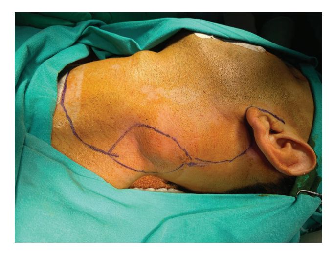
Figure 1 High-grade mucoepidermoid carcinoma case, preoperative

Of the patients who underwent parotidectomy in our clinic, 39 were female (39.8%) and 59 were male (60.2%). Details regarding gender and pathologies are shown in Table 1. The average age of the patients was 52.2 years (range 17-77 years). Almost all operated patients (96.8%) presented with a complaint of swelling in front of the ear. Only one (1%) patient presented incidentally, one (1%) was referred for follow-up MRI, and one (1%) presented with facial paralysis. No additional diseases were found in 59 (60.2%) patients.