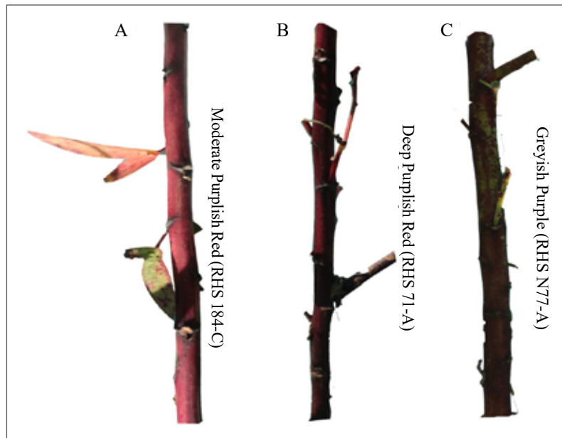
Figure 3. Different varieties of Hibiscus sabdariffa stem (A) Jor Lab HS-6, Jor Lab HS-19, Jor Lab HS-42, (B) Jor Lab HS-9, Jor Lab HS-16, (C) Check variety (Local)