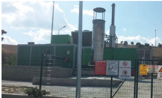
Figure 2. General view of the facility

In this study, biogas production of electrical energy generation facility in Erbaa town of Tokat province from the domestic wastes during 6 months of production period (between July and December 2015) were investigated and facility performance was assessed (Figure 2).