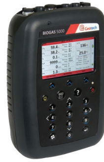
Figure 3. Gas meter

During the biogas production processes, methane (CH 4 ), oxygen (O 2 ) and carbon dioxide (CO 2 ) measurements were performed daily at certain intervals. Measurements were performed with Geotech-brand gas measurement device (Figure 3). Instantaneous temperature and relative humidity measurements were also performed throughout the experiments. These measurements were performed with Clima air-brand temperature and humidity meter.