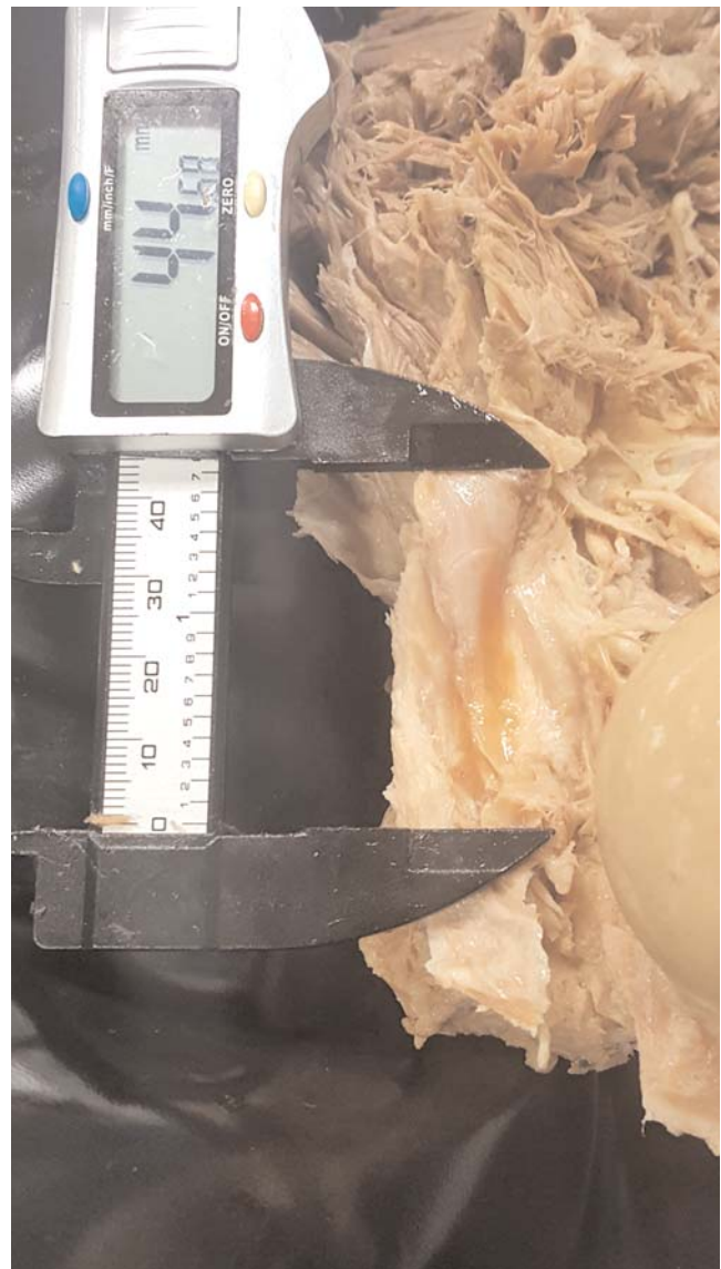
Figure 3. Cadaveric example of the left zona orbicularis and its length. [Color figure can be viewed in the online issue, which is available at www.anatomy.org.tr ]