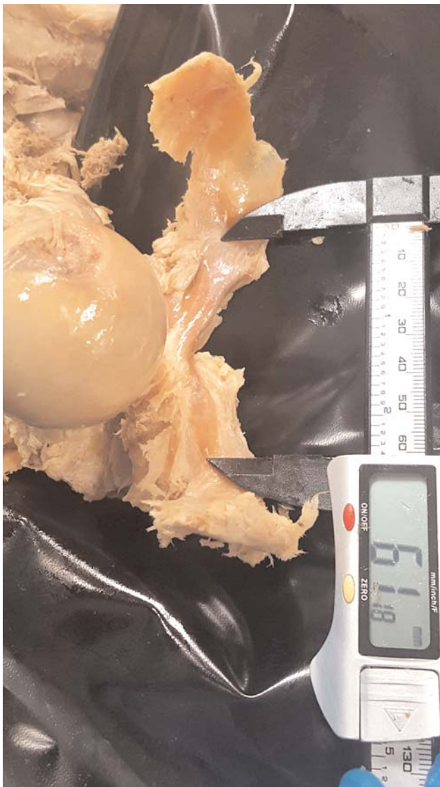
Figure 2. Cadaveric example of the right zona orbicularis and its length. [Color figure can be viewed in the online issue, which is available at www.anatomy.org.tr ]

orbicularis were confluent with the fibers of the iliofemoral ligament. The mean length for right sides was 35.95 mm and the mean length for left sides was 43.93 mm. The mean width for right sides was 3.74 mm and the mean width for left sides was 4.4 mm. There were no significant differences between right and left sides for zona orbicularis length or width. There was no significant association between age and sex but a statistically significant correlation ( r=0.959 ) between right and left zona orbicularis lengths ( p=0.041 ). However, there was no significant correlation between right and left zona orbicularis widths ( p>0.05 ). The fibers of the zona