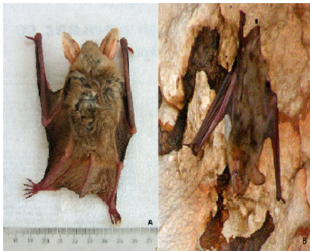
Fig. 1. Two sibling species Myotis myotis (A) and Myotis blythii (B)

This study is based on 34 (29 ♂♂ and 5 ♀♀) Myotis myotis and 9 (6 ♂♂ and 3 ♀♀) M. blythii specimens collected from different localities of Turkey between the years 2003 and 2006 (Fig. 1).