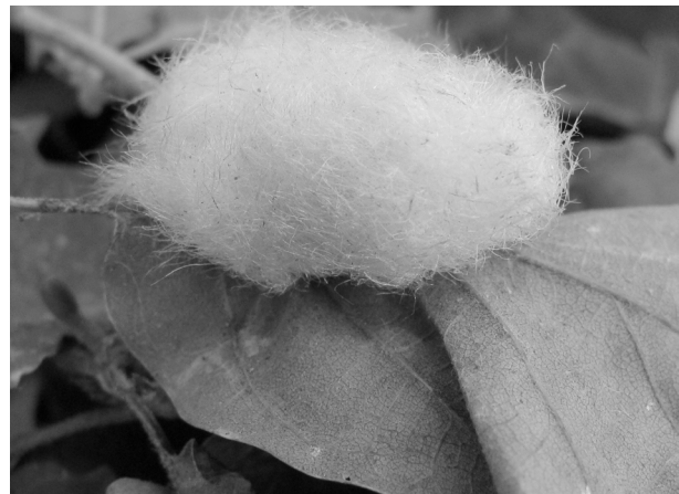
Figure 1. Cynips korsakovi galls underside of the leaves of the host, Quercus macranthera