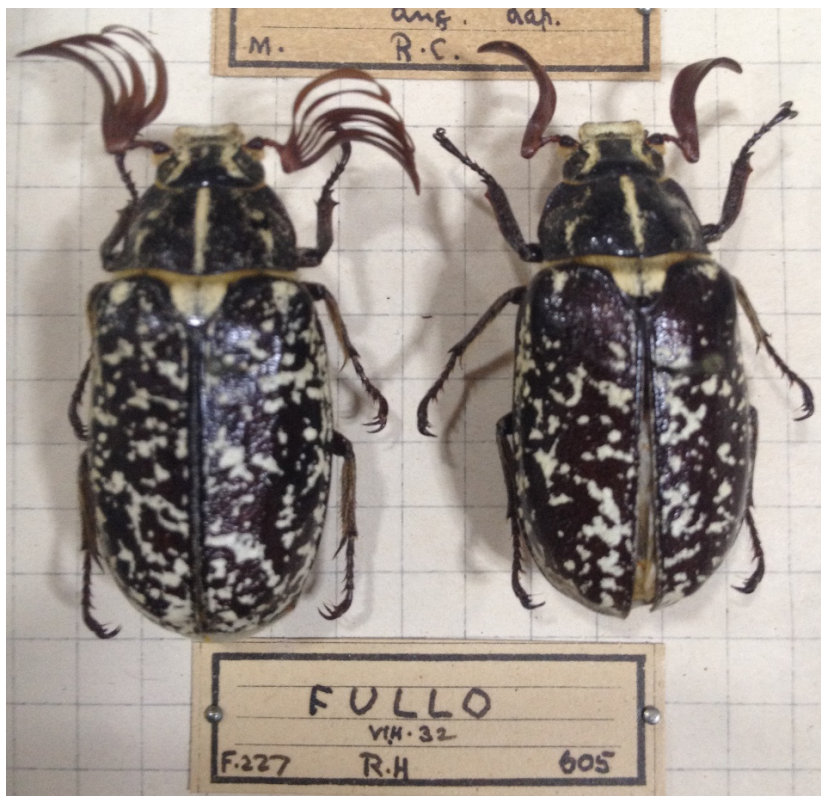
Figure 4: Male and female Polyphylla fullo specimens from Rumeli Hisari (R.H), date: VIII.1932.