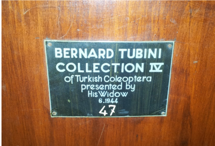
Figure 1: Front label of the fourth cabinet of Tubini Collection.

The species and the generic names on the label of the specimens were checked, synonyms, misspelled words are corrected according to the Fauna Europaea (2017), Discover Life (2017), IUCN (2017), UK Beetle Recording (2017), Barsevskis et al. (2017) and Muséum national d'Histoire naturelle (2017) databases. Also taxonomic ranks of the groups were evaluated according to the Fauna Europaea database and Borror et al. (1989).