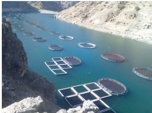
Picture 1. Viewing a net cage farm in Elazığ city in Keban reservoir [10].