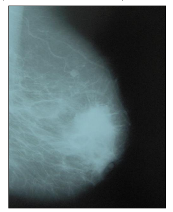
Figure 1: Mammographic view.

mass measuring 35x25x25 mm diameter located in the upper inner quadrant of left breast. Microscopic examination with immunohistochemical staining revealed high grade neuroendocrine small cell carcinoma. Positivity for neuron spesific enolase (NSE), chromogranin and synaptophysin was found 70%, 70%, 80% of tumor cells respectively. The patient received postoperative chemotherapy and adjuvant radiation treatment The patient was discharged seventh postoperative day. There is no problem in 13 months follow up.