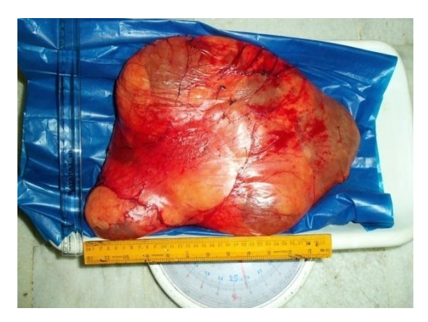
Figure 5: Specimen of 30x30 cm and 6 kgs of primary peritoneal hydatid cyst of sigmoid mesocolon.

Clinical presentations vary with the site and size of cyst and usually result from complications due to mass effect of the enlarging abdominal cyst. Abdominal pain, distention, intestinal obstruction, urticaria, urinary symptoms and a palpable mass with a large cyst are the most common presentations. On reviewing the literature a case of sigmoid colon obstruction is reported in a case of sigmoid mesocolon primary peritoneal hydatid disease, similar to our case. Intra peritoneal rupture may also present as acute abdomen. Antigenic fluid released into the peritoneal cavity and absorbed into the circulation may present with acute allergic manifestations (3, 4, 10, 11)