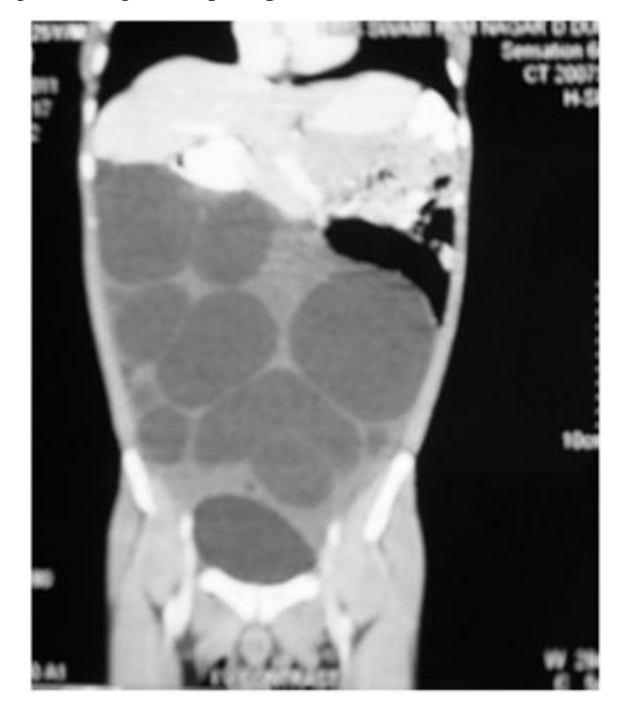
Figure 2: Contrast enhanced CT scan of abdomen showing a well defined peripherally enhancing thin walled multicystic intraperitoneal mass without any liver and splenic cyst.

hydatid cyst of the sigmoid mesocolon. Patient was given a regime of postoperative albendazole.