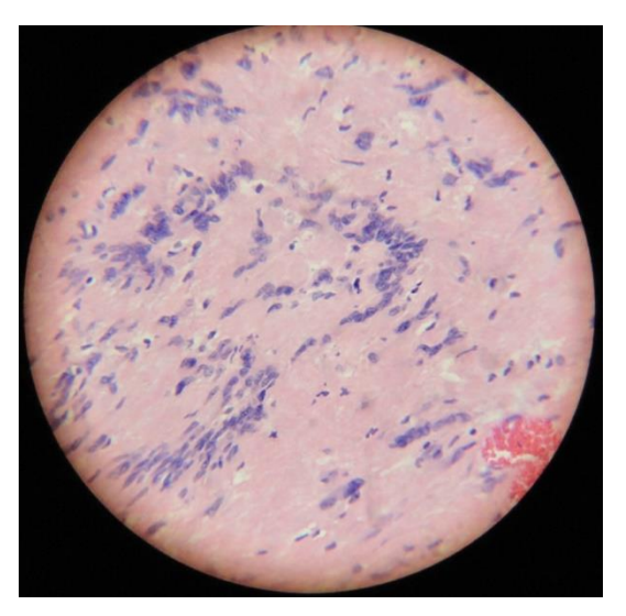
Figure 3: Microscopic view of schwannoma (Magnification – 400x; Stain used HE).

tion showed (Figure 3) spindle shaped cells with elongated nuclei, mild nuclear pleomorphism, Verocay bodies and mitosis, suggestive of benign schwannoma of retroperitoneum. The resection margins were free from tumor invasion. Immunohistochemistry study of the tumor cells expresses S-100 protein positivity with negative results for Desmin, SMA and CD-34. Post operative period was uneventful with discharge from hospital on 5th post operative day. He is under regular follow up in our out patients' department for last 3months following operation without any evidence of recurrence.