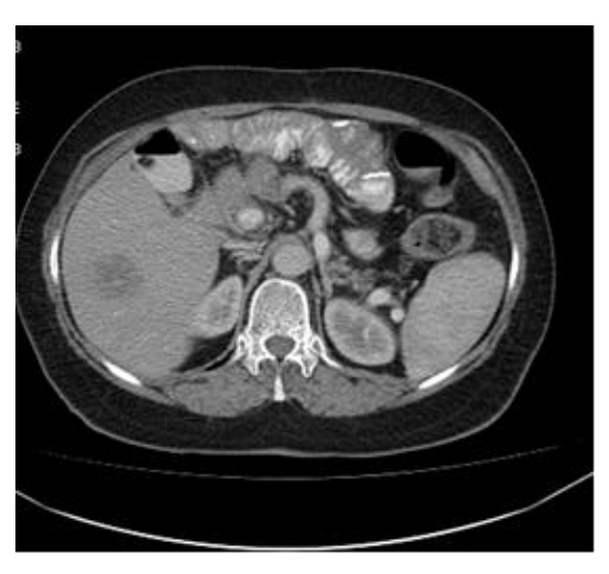
Figure 1: The computerized tomography image of the metastatic lesion.

In the preoperative setting for liver resection, volumetric CT scan for liver, tumor marker assessment, routine blood samples and thorax CT for detection were routinely performed. CT revealed a 3.5 cm diameter mass in segment 6 (Figure 1). Segment 6 volume was 15% of all liver and right hepatic lobe volume was 70%. Remnant liver volume would not be enough and liver failure could be occured with right hepatic lobectomy. And also we had to do new biliary reconstruction for the hepaticojejunostomy of Whipple procedure. So we planned a parenchyma sparing surgery.