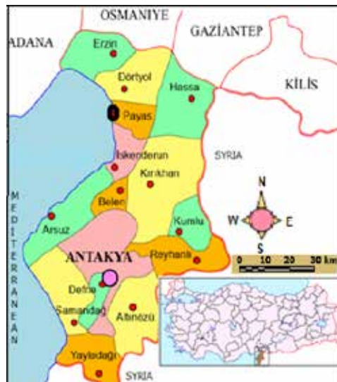
Figure 1. Research area

moistened with distilled water 24 or 48 hours (In winter 24 hours, summer 48 hours). When developing myxomycetes were found, the moist chamber was allowed to dry slowly and the myxomycetes were then dried for one week. (Stephenson and Stempen, 2000; Baba, 2012).