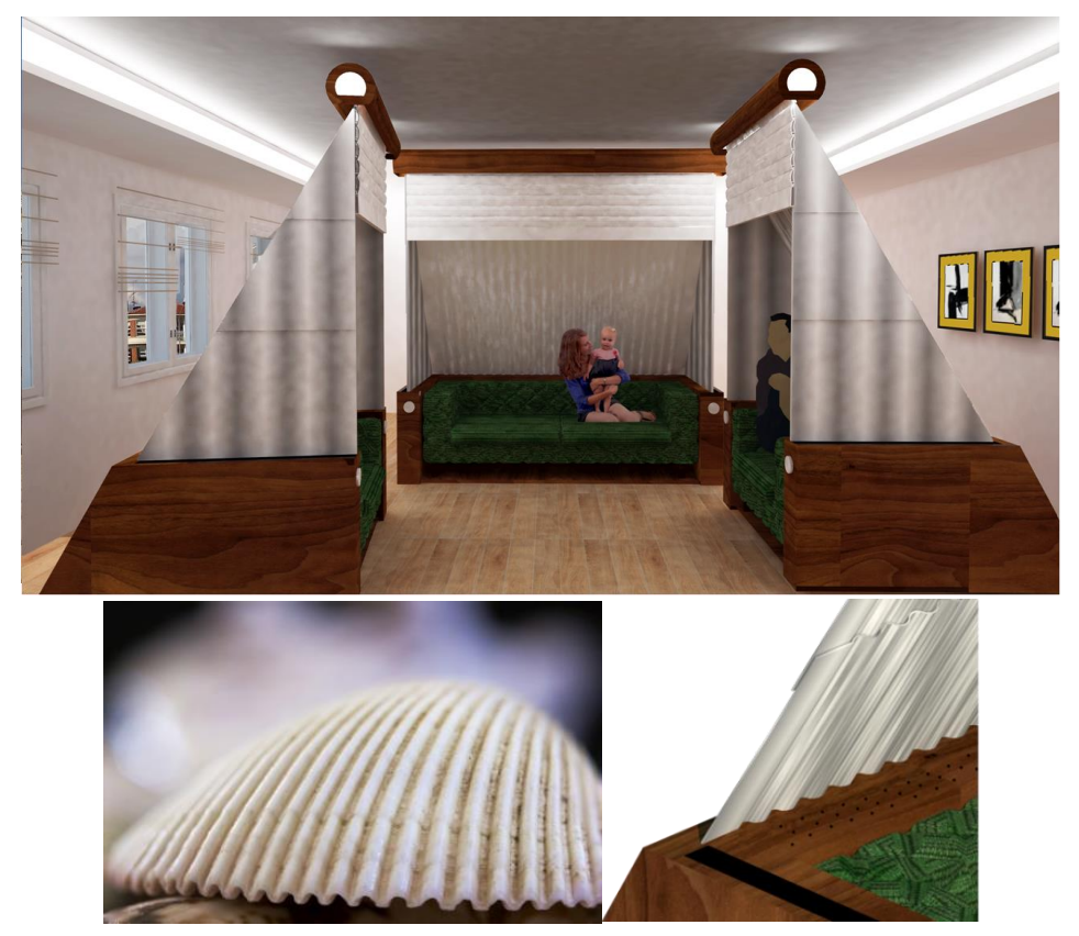
Figure 5. A steel shutter mechanism inspired by the mussel shell (concept design)

the shells to withstand very high pressures despite being thin. Finally, the shutter system in the lighting element works goes down and locks itself up. The shutter system, which can be controlled from inside, can be unlocked and opened after the earthquake (Figure 5). The ventilator automatically works when the shutter runs.