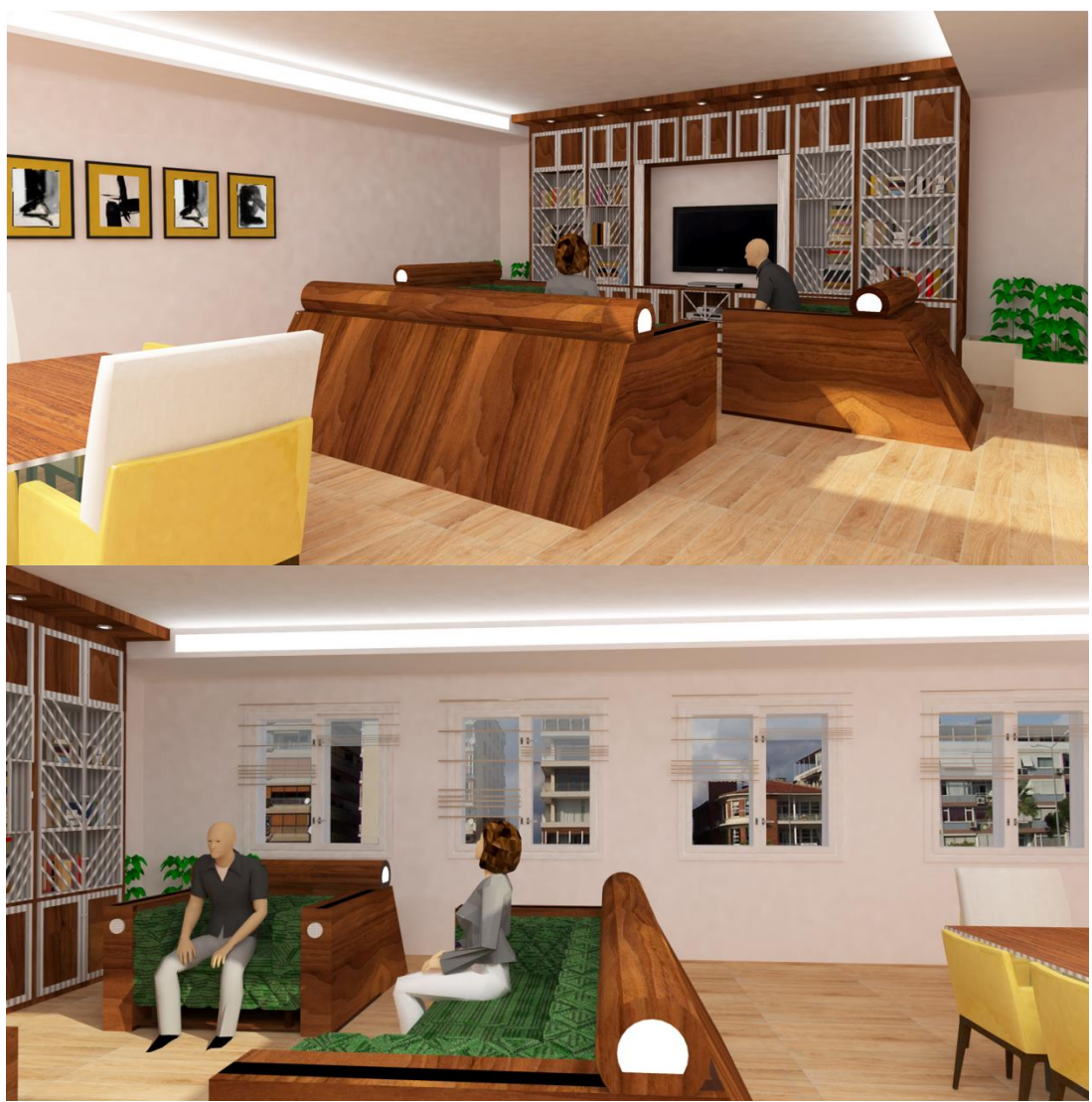
Figure 1. The views from the layout of living room (concept design)

The layout was planned according to the possibility of any destruction that may occur during the earthquake (Figure 1). The seating arrangement and the section where the TV unit and the bookshelf are located are in a mutually supportive manner in accordance with the possibility of collapse of the upper floor during an earthquake.