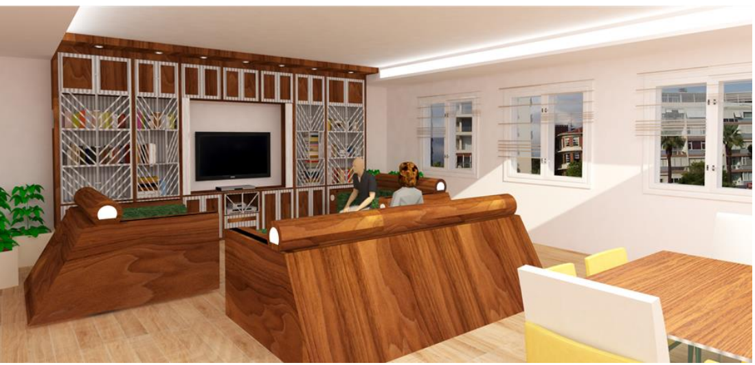
Figure 4. A lighting element on the back of seat (concept design)

In addition, lightening element has a steel shutter system that protects against earthquakes. During the earthquake, the loudspeaker in the front of the furniture will be heard, and after 10 seconds, the steel mechanism inspired by the mussel shell will start to work. Then the mechanism on the sides of the seat will move upwards. It places to the steel on the ceiling and supports it. Opposite curvatures in mussel shells provide