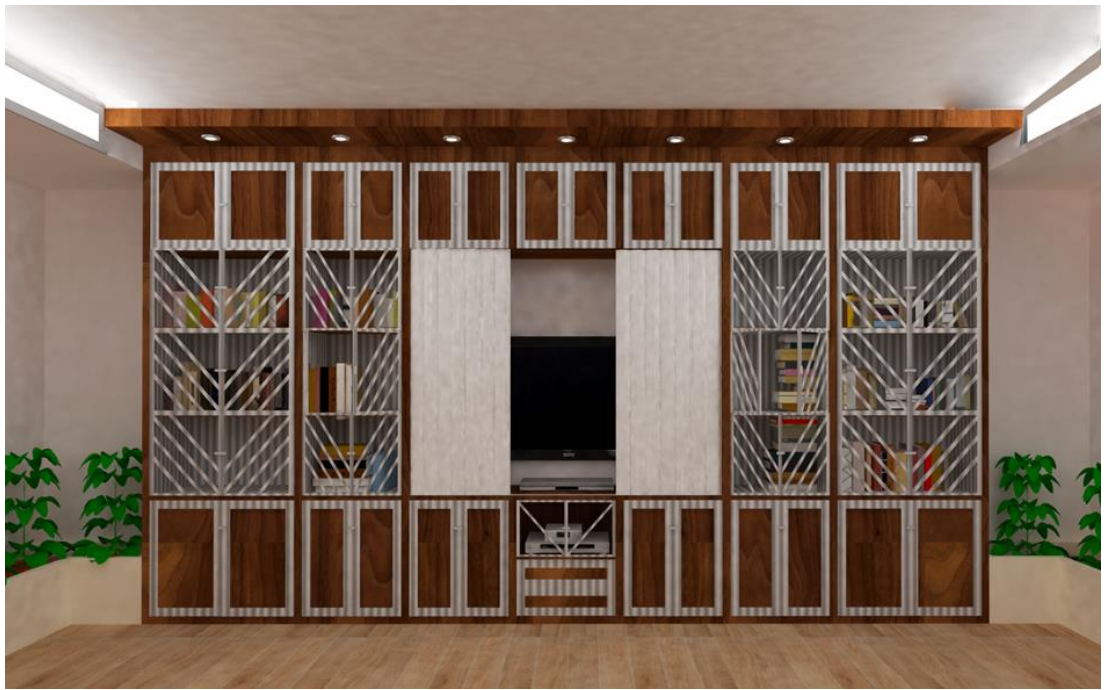
Figure 3. Concept design of bookshelf and TV unit

ceilings and fixed flowerpots. In addition, the spots placed in the bookshelf contribute both to the illumination of the salon and to decorative purposes. The TV unit in the middle of the bookshelf runs with an earthquake sensor and its doors prevents the TV from falling (Figure 3).