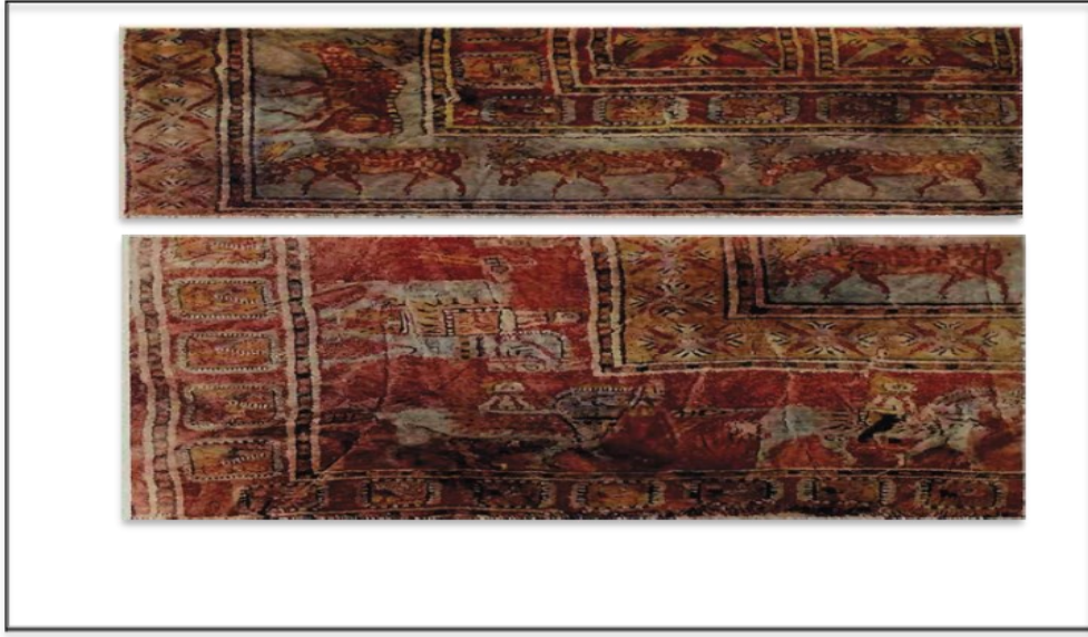
Figure 2. Pazyryk carpet 27

There is a close relationship between functionality and aesthetic elements in the artistic understanding of nomads; this has shaped their artistic productions in a way that intertwines both daily use and cultural expression. 25 In this context, the Pazyryk carpet from the Altai region is an example that best reflects this characteristic of nomadic art in terms of portability and functionality, as well as aesthetic and mythological elements. 26 For example, Figure 2 shows a Pazyryk carpet from the Altai region. As an important example of nomadic art, the carpet is decorated with intricate animal motifs and mythological figures. Known for being portable and functional, this carpet also reflects the relationship of nomadic culture with nature with its artistic and aesthetic value.