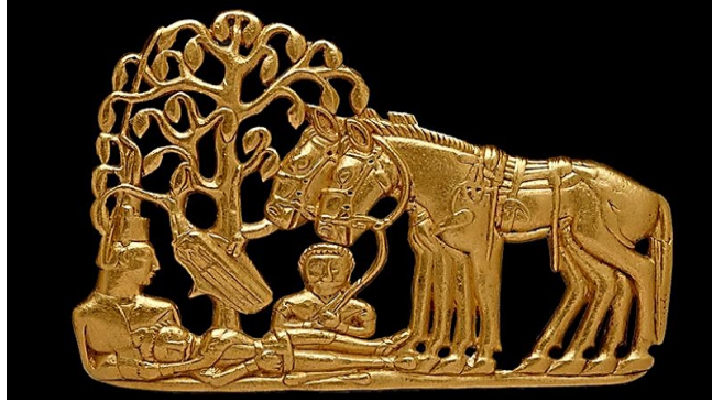
Figure 1. Scythian gold artifact 23

The nomads' understanding of art exhibited a structure that combined functionality and aesthetics, and these features became evident especially in works of art where portability was at the forefront. Their mastery in fields such as metalworking and weaving enabled them to produce products that appealed to both the practical needs of daily life and aesthetic values. In this context, the Scythian Golden Artifact stands out as a work that exemplifies the artistic and functional perfection achieved by nomads in metalworking, which reflects the artistic understanding of nomadic societies on both practical and aesthetic levels. In this context, the Scythian Gold Artifact is presented in Figure 1.