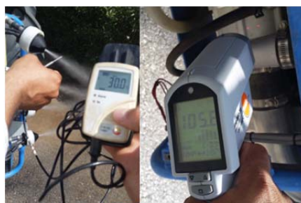
Figure 6. Measuring the temperature of the nozzle outlet and supercharger

Flow rates of both sides of the sprayer can be controlled by the flow disk. The flow disk size is No. 59, whereas the flow rate was 225 \text{ ml min}^{-1} . The nozzle orientation can be done easy without any hand tool. Nozzle can be adjusted for wide range of row distances. Also for different forward speeds, the nozzles' direction can be adjusted all directions. During the tests the operator practiced the sprayer for one hour. After one hour working time, the temperature of the nozzle outlet and supercharger was measured (Figure 6). In front of the nozzle outlet the average temperature was 30 \text{ }^\circ\text{C} , whereas the average temperature on the supercharger was 105 \text{ }^\circ\text{C} . For this reason special cooling system was developed by the manufacturer to cool the airflow. The cooling liquid for the system is oil.