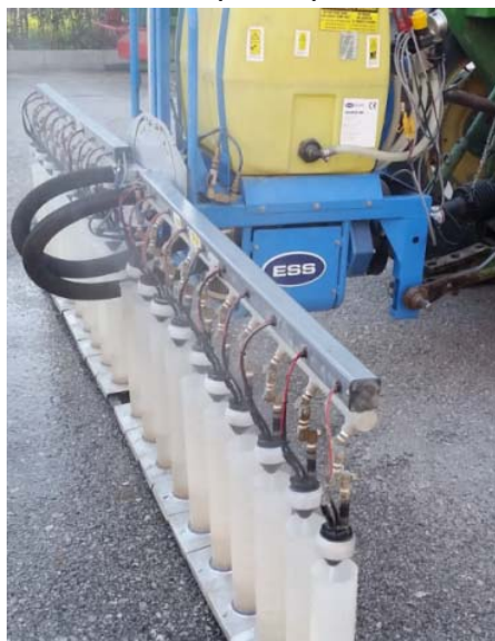
Figure 5. PTO driven mounted type orchard-row crops sprayer

supercharger instead of blower. Basic specifications of sprayer are shown below (Table 3).