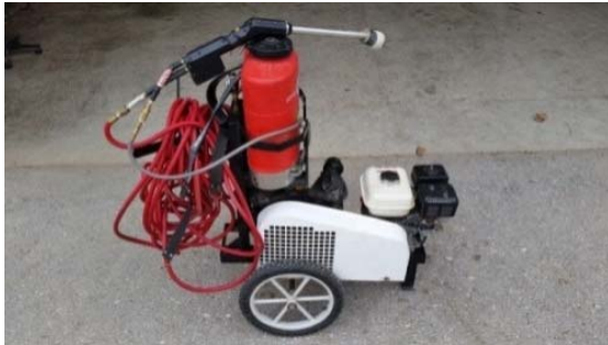
Figure 1. General view of petrol engine-driven mobile sprayer

Air compressor is driven by petrol engine. Air mixes with spray liquid in the spray gun and atomization as well as charging of liquid occurs in spray gun. Parts of the spray gun are shown below (Figure 2). For operator's safety, spray gun is powered by a low-voltage power supply. The rechargeable 9 V batteries are in the handle of the spray gun. The electrostatic charge imparted to the spray is not strong enough to harm people. Charging time for the battery is minimum 12 hours. The spray gun was used 13 to 15 hours of operation on a charge.