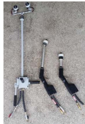
Figure 4. Types of the spray gun

There are different types of spray gun (Figure 4). Because of narrow working width, longer spray gun with double nozzle may be used in various plant heights.