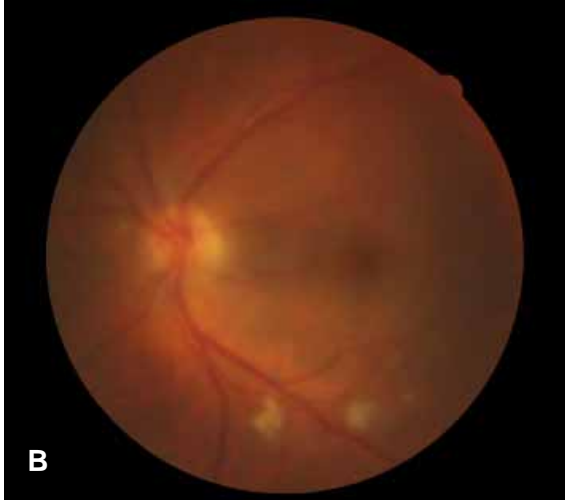
Figure 2. The right optic disc (A), The left optic disc (B)