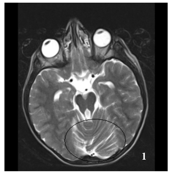
Figure 1. Cerebellar peduncles and vermis hypoplasia in Joubert's syndrome

demonstrated in ADHD. Areas of decline are especially prefrontal cortex, basal ganglia, cerebellum and temporapariatel areas. In addition, problems in completing a timing task in ADHD were associated with the cerebellum [10]. In neuroimaging studies performed on schizophrenia, it has been shown that there are pathologies in the cerebellum vermis, particularly in relation to the dysfunctions associated with certain tasks. Cerebellar dysfunction also causes various developmental problems such as ADHD, autism, and dyslexia. Studies have shown that inferior-posterior vermis of cerebellum in children with ADHD is smaller when compared to the control group [11]. In patients with ADHD, structural delayed fronto-striatal. fronto-temporo-parietal, and fronto-cerebellar nerves were shown in the structural MR studies compared to control groups. It is known that the above-mentioned networks are mediated by cognitive functions. In ADHD, decreased volume and increased cortical density are observed in the frontal brain regions, parieto-temporol area, basal ganglia, posterior cingulate, cerebellum, and splenium of the corpus callosum [12].