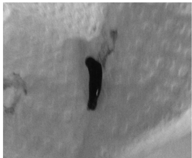
Figure 2. The leech obtained from the patient.

in the upper airway system was reported by the Persian physician Rasis 3 . Leech infestations among humans is very rare and can be seen especially in urban areas. The people who live in urban areas think that mountain waters may be beneficial. The usage of this waters may cause some elusive parasitic infestations; like leech infestations 7 . Swimming in streams or drinking infested water are the contamination ways of the leech infestation. When the contaminated water is drunk the leech