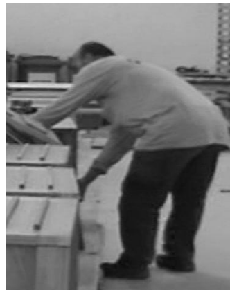
REBA Score: 9