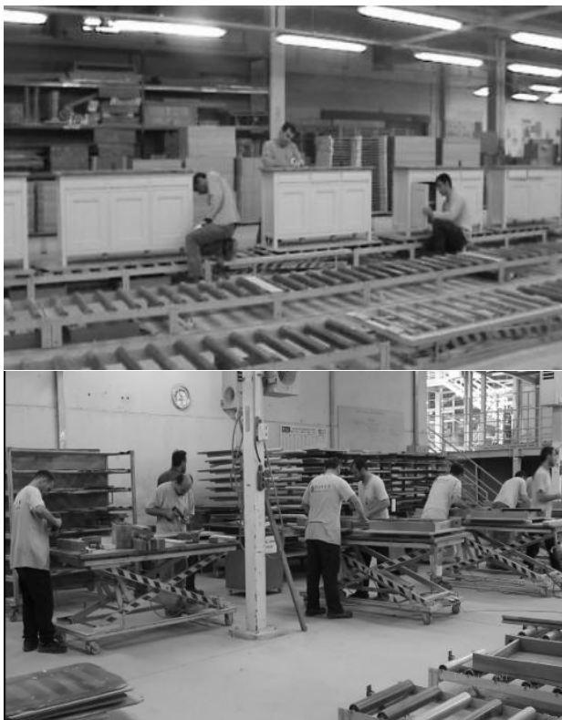
Figure 1. Working postures of workers using and not using HAB in assembly and quality control departments.

Final stage, a Rapid Entire Body Assessment (REBA) analysis was executed on a selected subset of 15 randomly selected participants, with one female participant included in this subgroup. This study incorporated Reba analysis to assess the risk scores related to work postures, both prior to and after the introduction of a height-adjustable workbench (HAB) intervention, with specific attention directed toward the assembly station (Figure 1). The REBA analysis involved capturing snapshots at 3-second intervals from 15-minute videos recorded on various days and times. The assessment focused on identifying the most frequently recurring movements within these snapshots for comprehensive evaluation.