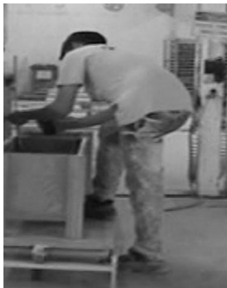
REBA Score: 11