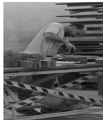
REBA Score: 5