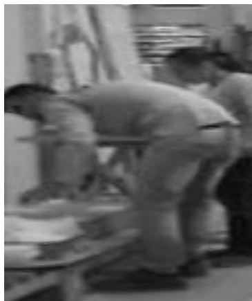
REBA score: 9

The role of a furniture assembler requires a high degree of precision and meticulous attention to detail. While the REBA method is a relatively recent innovation in the context of furniture assembly, its application in assembly lines is a well-established and widely adopted approach across numerous sectors (Sujatmiko and Akmal, 2024; Drinkaus et al. 2003; Chakravarthy et al., 2015; Qutubuddin et al. 2013a, 2013b). This study has identified a number of potential risks inherent in the assembly process, including repetitive movements, prolonged static postures, and physically demanding tasks, particularly when performed on a stationary assembly line. It would be prudent to focus on the areas of concern affecting the waist, back, and joints, as these have the potential to increase the risk of long-term health problems for workers. In a similar study, Bao et al. (2021) found that even with adequate ergonomic support, physically demanding tasks can lead to fatigue and cellular resource depletion. It is also possible that this situation may apply to furniture assembly workers.