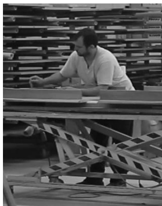
REBA Score: 5