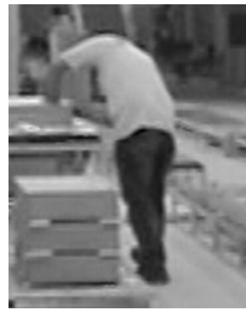
REBA score: 9