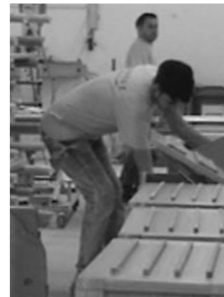
REBA Score: 11