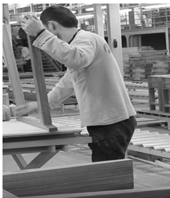
REBA score: 4