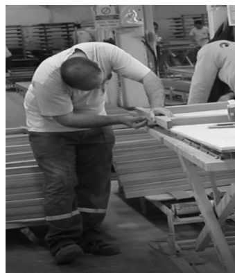
REBA score: 7