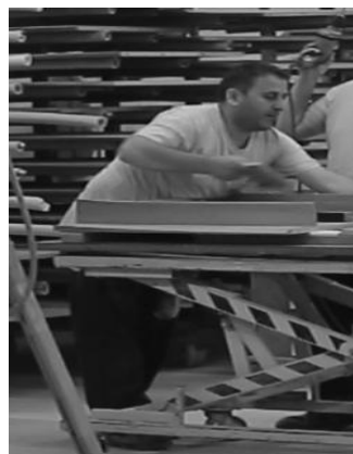
REBA Score: 3