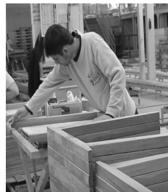
REBA score: 5