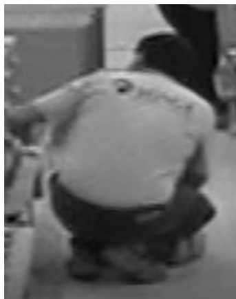
REBA score: 9