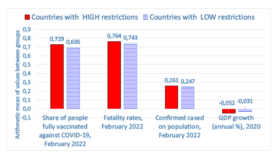
Figure 1. A comparison of health and economic metrics between nations that have implemented stricter COVID-19 regulations and those that have not

The trend depicted in Figure 1 suggests a counterintuitive relationship between the COVID-19 strictness of containment and their effectiveness measures in mitigating the pandemic's negative effects. While countries implementing a high degree and mandatory of restrictions social behaviors tend to achieve higher vaccination rates, this does not necessarily translate into a reduced societal burden. These nations may still experience a significant negative impact from the pandemic on their social