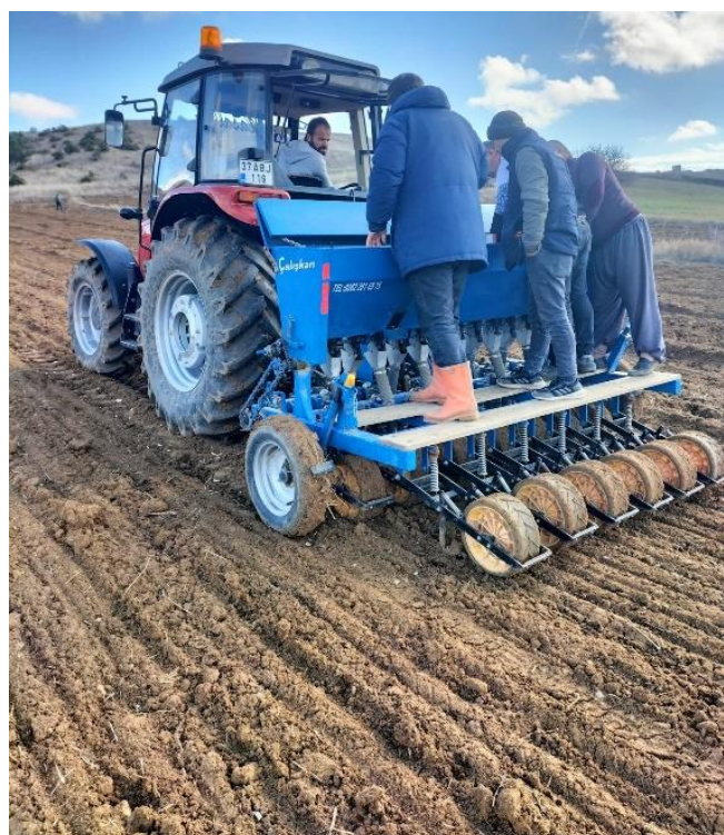
Figure 3. The field where the experiment was conducted