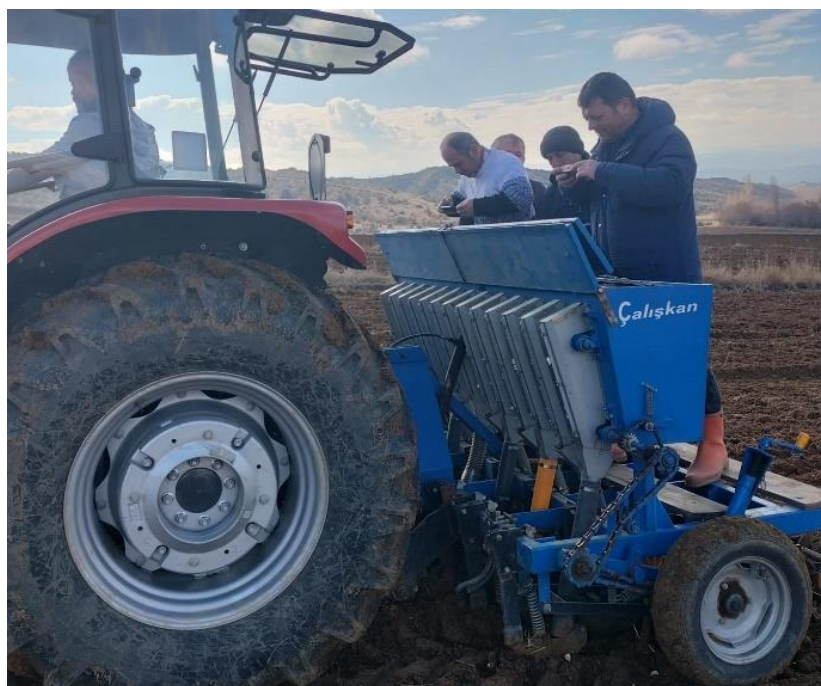
Figure 4. Taking images with a camera during planting

A total of 13 spoon bands of the precision planting machine, divided into four different chambers during planting, were recorded with a camera. Camera recordings were made with two mobile phones carried by two people. The recording with one camera is listed on half of the machine's spoons. The camera records were then examined slowly, and the garlic cloves taken with each spoon were counted. While counting the camera images, images of 10 spoons with five replications at different times for each variable were examined. Spoons with more than one tooth were calculated as twinning, spoons with one tooth were calculated as standard, and spoons with no teeth were calculated as empty crossing.