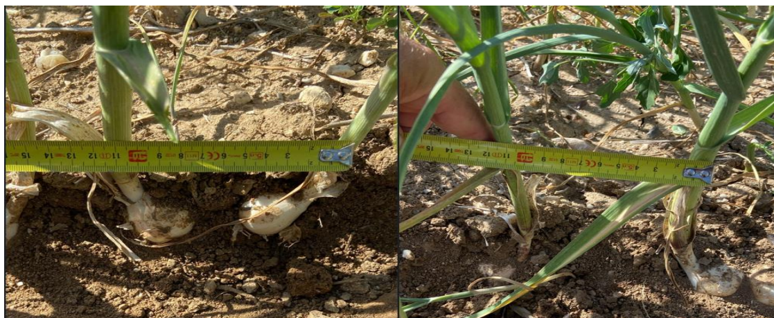
Figure 5. Measurement errors of sprout spacing

Our study was also the first to determine planting performance with camera images during field trials. Although there are studies conducted with camera images and image processing techniques in laboratory environments in existing studies, image analysis was not encountered in field trials.