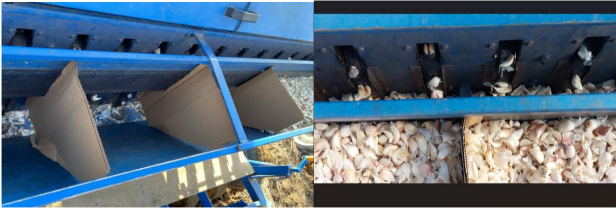
Figure 1. Seed chamber compartments