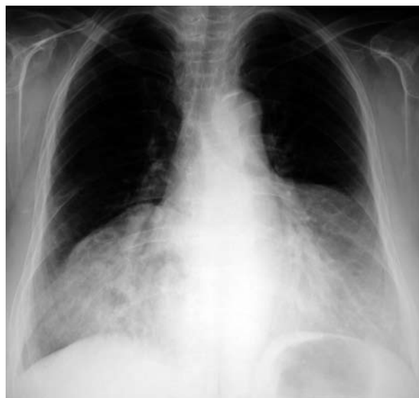
Fig. 1. Posteroanterior chest radiography of the patient at admission shows right paracardiac mass, bilateral lower lobe atelectasis and radiopacity.

A 76-year-old woman weighing 114 kg presented to the emergency room with worsening chest pain and shortness of breath on physical exertion for two years. There was no significant past medical history or trauma. Auscultation revealed no audible breath sounds in the bilateral lower sites of the chest. Physical examinations revealed stable vital signs. The laboratory results were in normal limits. In electrocardiography (ECG); T wave negativity in D2, D3, aVF, and low voltage were determined in all derivations. Echocardiogram measured normal cardiac chamber volumes and ejection fraction. She had no abdominal symptoms of pain, food intolerance, emesis, nausea, vomiting, cramping and distension. A posteroanterior chest radiography showed right paracardiac mass, bilateral lower lobe atelectasis and radiopacity (Fig. 1). Computed chest tomography (CT) revealed an anterior diaphragmatic hernia through Morgagni defect, transverse colon and omentum in the anterior mediastinum, compressed bilateral lung parenchyma and cardiac shifting to backward (Figs. 2a, b). The patient was diagnosed as bilateral, giant Morgagni hernia. She was transferred to the general surgery department for elective laparotomy. Laparotomy was planned for reducing abdominal contents into peritoneal cavity and repairing diaphragmatic defect. An elective transabdominal surgical repair via