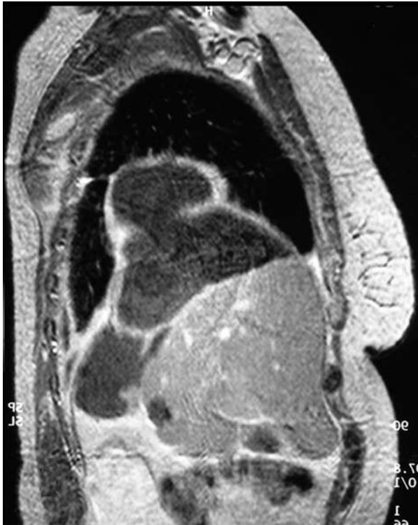
Fig. 2. Sagittal plane of magnetic resonance imaging showed lobulated cystic mass not originating from liver and lung parenchyma.

provided useful information about the anatomic location of the cyst. Chest radiography and CT were also helpful, providing information about the morphologic characteristics of cysts (i.e., a smooth, round, dense opacity) and their exact location in the thorax. Computed tomography may demonstrate germinative membrane but is otherwise not diagnostic. It may be visible by CT. Computerized tomography is helpful in showing the water density in intact cysts, but in complicated cysts it can be confused with mass lesions. Echocardiography should be used for myocardial and pericardial hydatid cysts. Magnetic resonance imaging is a useful diagnostic tool for extensions of primary diaphragmatic hydatid cysts (Fig. 2). It is clearly said that CT is necessary for all intrathoracic extrapulmonary cysts and should also be used in patients with extrapulmonary hydatid cysts, especially in complicated cysts (i.e., perforated or infected). Indirect hemagglutination tests can be used for exact diagnosis but one must remain aware of their tendency toward false-positive results.