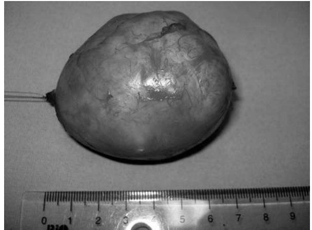
Fig. 2. Postoperative photograph of ganglioneuroma.

show any atypia (Fig. 3). The spindled tumor cells showed strong positive reaction for S-100 protein and were negative for synaptophysin, desmin and \alpha smooth muscle actin immunohistochemically (Fig. 4).