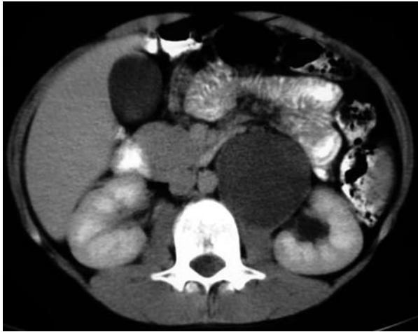
Fig. 1. Computed tomography scan shows a mass arising in the retroperitoneum.