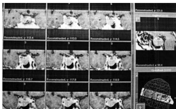
Fig. 1. Gamma Knife surgery planning chart for the patient.

right optic nerve and right oculomotor nerve. The right oculomotor nerve at the oculomotor trigone, which is the entry point to the cavernous sinus, appeared larger than typical due to tumoral infiltration (Fig. 3a, b). The cavernous sinus was opened and the tumor partly evacuated for decompression. The values of cortisol and ACTH decreased to 9.7 ug/dl and 39.4 pg/ml, respectively, at the postoperative period. Histological examination showed typical features of pituitary adenoma. The postoperative course was uneventful with no improvement in the oculomotor nerve palsy. The patient was discharged to be followed-up regularly by the endocrinology and neurosurgery departments. She was re-hospitalized a month later with a complaint of dyspnea. Lobar pneumonia was diagnosed and the patient was lost due to lung infection and sepsis after 48 days.