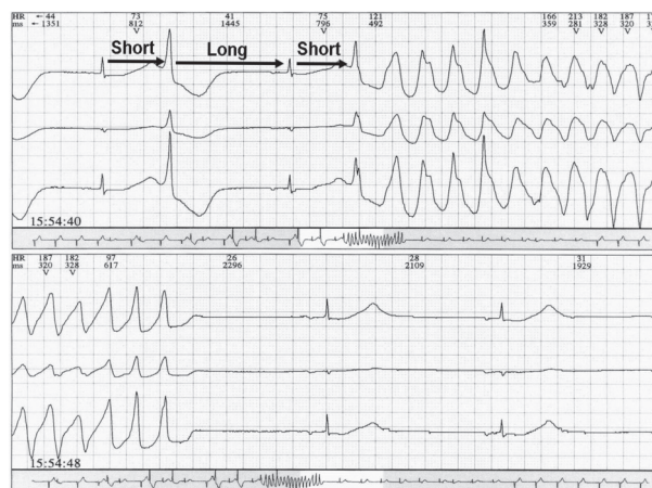
Fig. 2. Example of a self-terminated episode of TdP preceded by the characteristic "short-long-short" sequence in a patient with drug-induced QT interval prolongation.

Furthermore, pharmacokinetic interactions with drugs known to inhibit cytochrome P450 isoenzymes (CYP3A4 or CYP2D6) enhance the torsadogenic potential of these agents by decreasing their clearance. [1,5,20] CYP3A4 activity can be inhibited by a wide variety of drugs including some macrolide antibiotics, ketoconazole and related antifungals, cimetidine, fluoxetine, protease inhibitors, and amiodarone. In addition, many non-drug factors, including age, smoking, hepatic disease, genetic polymorphisms and grapefruit juice may lead to CYP3A4 inhibition. [7] Finally,