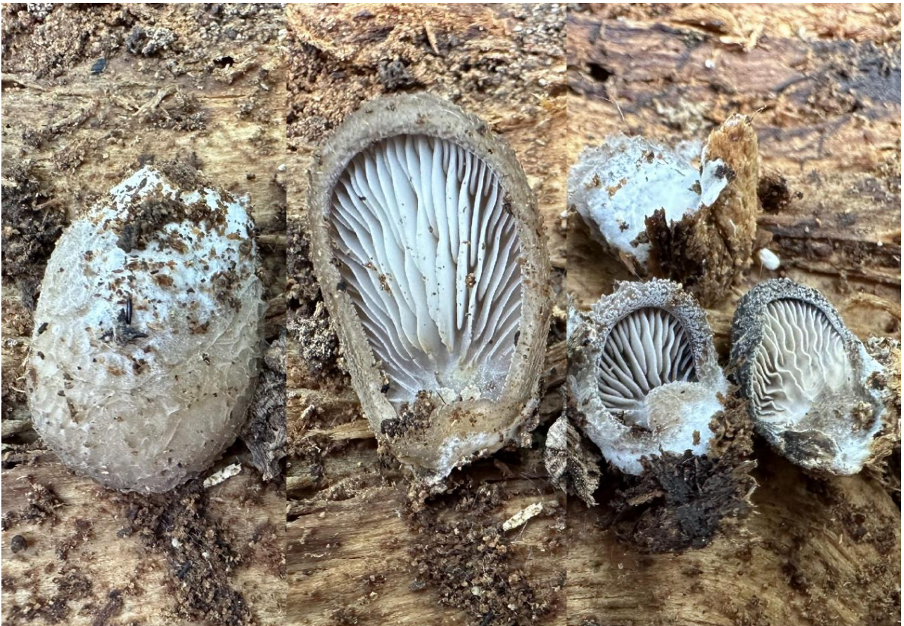
Figure 1. Basidiocarps of Hohenbuehelia mastrucata

Macroscopic and microscopic features: Cap 20-50 mm across, convex to planoconvex with an inrolled margin, circular, semicircular, shell-shaped or fan to kidney-shaped, some becomes wavy and lobed at maturity. Gray, bluish gray, brownish gray to buff, covered with a dense tomentum that forms a reticulate pattern. Flesh thin, gelatinous to rubbery when dry, whitish gray, taste mild, odor not distinct. Gills radiating from the attachment point, subdecurrent to adnate, close to subdistant, whitish to whitish gray. Spore print white. Stem absent or with an indistinct stipe, fruit body laterally attached to the wood. Basidia 26–41 × 7–9 μm, cylindrical-clavate, hyaline, 4-spored. Cheilocystidia 30–43 × 4.5–6.7 μm, clavate-capitate to lageniform, with necks 2–2.5 μm across. Pleurocystidia up to 70–100 × 15–19 μm; lanceolate, fusiform, thick-walled metuloid with apical or sheathing encrustations. Basidiospores 6.8–8.7 × 3.5–5.5 μm, ellipsoid to cylindrical, rarely ovoid, smooth, inamyloid.