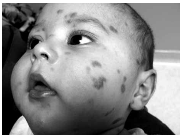
Fig. 3. Hyperpigmented and erythematous papules and plaques on the face at the age of 5th month.

The etiology of the mastocytosis is unclear. Recent observations have shown a soluble form of stem cell factor in the skin and suggest an etiologic role for derangements of this growth factor and its receptor. [5,6] In addition, a somatic mutation of the proto-oncogene c-kit that could be responsible for mast cell proliferation has been detected. [2,4,6] C-kit mutation analyses are