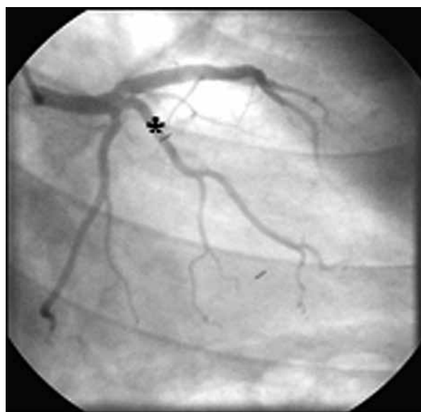
Fig. 3. Trifurcation (*) with an atherosclerotic plaque in proximal LAD.

In previous studies another statement about the T length is that it also has an effect on LAD-Cx bifurcation angle. Gazetopoulos et al., [7,12] Reig and Petit [5] suggest that there is a positive correlation between the length of the trunk and