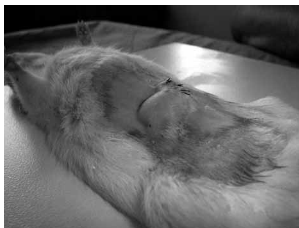
Fig. 1. The appearance of subjected strangulated hernia in a rat.

Blood samples were collected by cardiac puncture into tubes containing 0.123 mol/L sodium citrate. Plasma was separated by centrifugation at 3000 g for 10 min and stored at -70°C until assay. A latex agglutination test (D-di Test®, Diagnostica Stago, France) was used for D-dimer measurements. Values of <0.5 µg/ml were considered normal, since the D-di Test reacts with the levels of >0.5 µg/ml. Leucocytes, neutrophils, platelets and lymphocytes were measured on ABX-PENTRA 120 DX® Hematology Analyzer (ABX Diagnostics, France). Biochemistry testing, including AST, ALT, LDH, ALP, CPK and D-Dimer was measured by UV-kinetic method with Olympus AU 2700® autoanalyzer (Olympus Diagnostics GmbH, Hamburg, Germany).