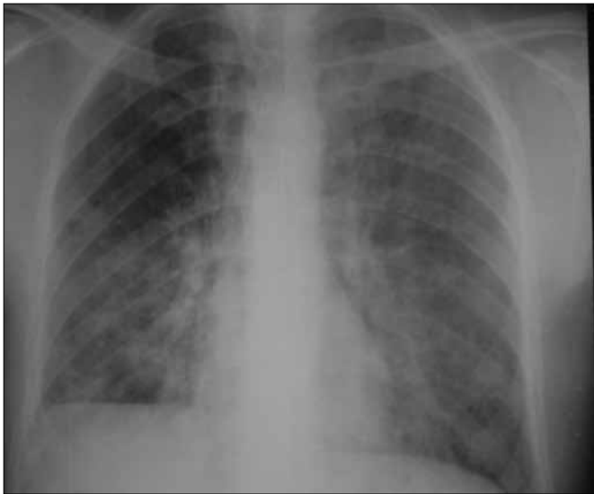
Figure 2. Chest radiograph obtained after MBALs