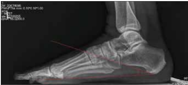
Figure 3. Lateral radiograph of foot showing the CPA

Surface area measurement of irregularly shaped structures by a point-counting method was described as an efficient approach for obtaining the required cut surface areas of the structure (8). The PAL method was previously suggested as an alternative to the Cobb method for the radiographic evaluation of the degree of lumbar lordosis when ImageJ's estimation was accepted as the gold standard (9). Authors stated that the Cobb method caused variability in the measurements because of vertebral end plate architecture variability, and offered that the PAL method may be a useful technique for the evaluation of the surface area of the semilunar region for lumbar lordosis (9). They argued that, because of the good agreement between planimetry and point-counting methods, the PAL method could be applied without requiring any software. The current study indicated that the PAL method can be used as an alternative method for measuring the semilunar irregular shape of the MLA in weight bearing lateral roentgenograms of the foot.