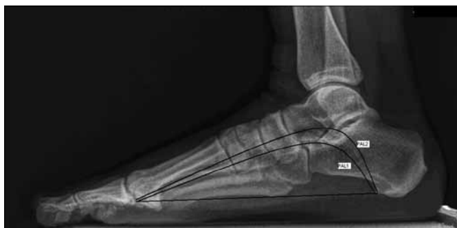
Figure 1. Lateral radiograph of foot showing the area drawn for the estimation of Projection area per length (PAL1 and PAL2)

Projection area per length squared (PAL) = [(a/p \times \Sigma P) / l^2] \times 100 , where \Sigma P denotes the point counts, (a/p) represents the area associated with each test point, and (l) is the measured length of the straight line between the most plantar process of the calcaneus and the head of the first metatarsal bone.