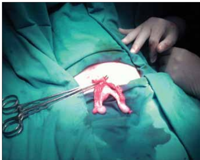
Figure 2. Intraoperative view showing both testes on the right side

A classification of this abnormality is defined according to the associated anomalies. In type I, TTE is associated with an inguinal hernia alone (40% to 50%). Type II is associated with persistent or rudimentary Müllerian duct remnants (30%) and type III is associated with disorders of genitourinary anomalies (hypospadias, scrotal abnormalities, and disorders of sex development) (20%) (5). According to this classification, all our patients are type-I patients. The typical one side inguinal hernia with an empty contralateral hemiscrotum was present in all our cases (7). No other associated anomaly was detected.