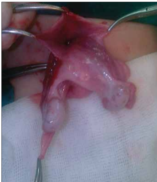
Figure 3. Intraoperative view of the right groin showing both testes with common hernia sac

Although the mean age at presentation was reported as 4 years, the mean age of our patients was 7.7 months (5). Since there are useful diagnostic modalities such as US scan, magnetic resonance imaging (MRI) and laparoscopy, most of the patients are still detected incidentally during exploration for inguinal hernia (7). An US scan may be helpful to detect the localization of the testes. We detected the contralateral