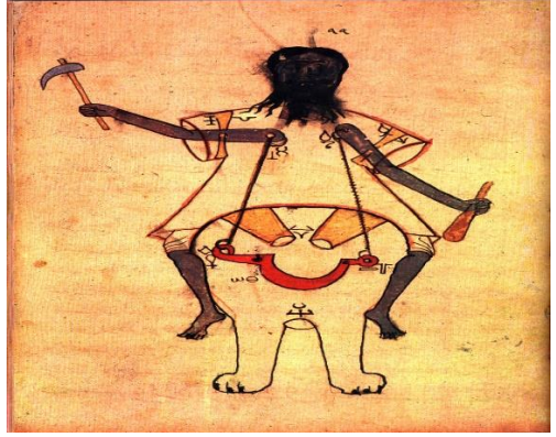
Figure 4 The first robotic gadget based on human intelligence

philosophical and scientific sides. For instance, Figure 4 is the first historical example provided by Al-Jazari, who lived during the 12th century in the southeastern part of present Turkey.