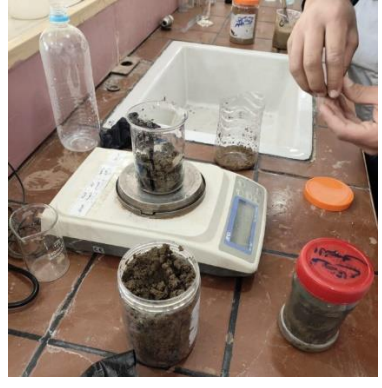
Figure 2. Preparing Samples