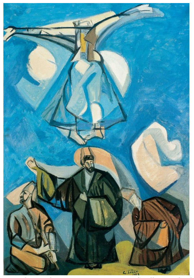
Figure 24. Mevlevis, oil on canvas, 81 x 116 cm, (Tollu, Mevleviler, 1958)