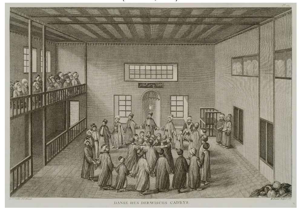
Figure 8. Dancing Dervishes by the Kadiri Sect from the 1790 edition of the book Histoire de l'Empire Othomane, (Laskaridis Foundation, 2014)