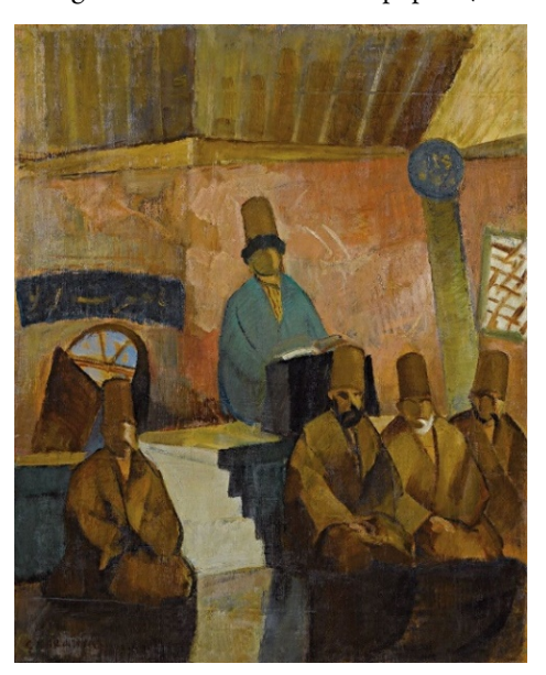
Figure 16. Mevlevis, oil on duralit, 60 x 74 cm, (Çallı, t.y.)