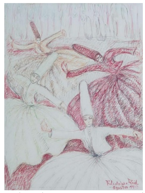
Figure 21. Mevlevis, Sharpie on paper, 35 x 50 cm, (Zeid, 1952)

At this point, Cemal Tollu's works depicting the Mevlevis deserve special attention in our history of art of painting. The primary goal in Tollu's figurative compositions is to be able to represent the human being. The human body and identity are positioned beyond the formal pictorial representation in the picture. In Tollu's Mevleviler series, there is an observation and a search for meaning that differs from other painters.