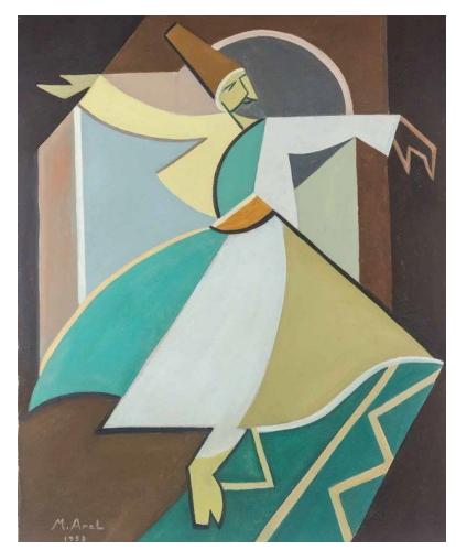
Figure 18. Mevlevi, oil on canvas, (Arel, 1958)

compositions that are processed by the abstraction reflex, although they are figurative. At this point, the negative common denominator of the works is that they are without content. In those paintings and engravings, mevlevism and its indicators have been able to reach formalistic variations.