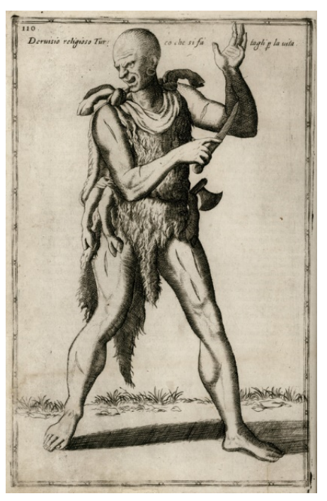
Figure 4. The illustration of the dervish from the 1580 edition of the book Quatre Premiers Livres des Navigations by the French geographer Nicolas de Nicolay

Gestures, movements and symbols in sema have become imprtant inspirational things for painters and over time those elements have became indicators representing sufis and dervishes in the art of painting. French orientalist painter Jean Leon Gerome (1824-1904), Flemish painter Jean Baptiste Vanmour (1671-1737), known for his whirling dervish paintings, Italian Fausto Zonaro (1854-1929), known by the title of Ottoman palace painter, are the artists who painted the Mevlevis in their works before modern art era.