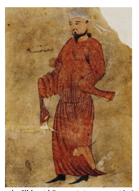
Figure 1. A dervish from the Ilkhanid State miniature art, 13x9.4 cm, 14. century, Iran, (Christies, Art of the Islamic and Indian Worlds, 2024)

Dervishes, sufis and mevlevis were among the subjects dealt with by painters (nakkaş) in the ages when the Islamic geography kept alive the tradition of miniature painting. The first dervish figures took place on miniature art of Middle East and the Far East in the 14th century. One of the infamous miniature painters was Mehmed Siyah Qalam and according to theories there are figures in his compositions that are suggested to represent dervishes. There are also dervish figures are depicted in miniatures which has survived from the Ilkhanid State (14<sup>th</sup>) to the present day (Christies, Arts & Textiles of the Islamic & Indian Worlds, 2024). Iranian miniature painting was developed in the 15th century, especially under the patronage of the Timurid (1370-1507) and Safavid (1501-1736) dynasties. and it has reached its peak in 16<sup>th</sup> century.