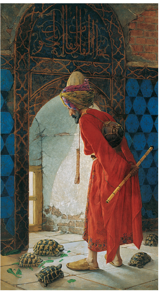
Figure 14. The Tortoise Trainer, oil on canvas, 122 x 222 cm, (Hamdi, 1906)

The bowl on his back is likened to the begging bowl used by the dervishes. "According to some, what hangs on a man's back is a kashkulufukara, a begging bowl made of coconut or ebony, formerly used by dervishes and beggars" (wikipedia, 2023) Considering that the old man represents a sheikh dervish and tortoises reoresent Sufis, an allegorical interpretation of the teacher-student relationship in Mevlevism stands in front of us.