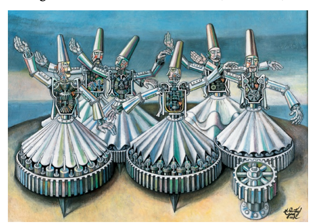
Figure 19. Mevlevis, oil on canvas, (Yener, 1998)