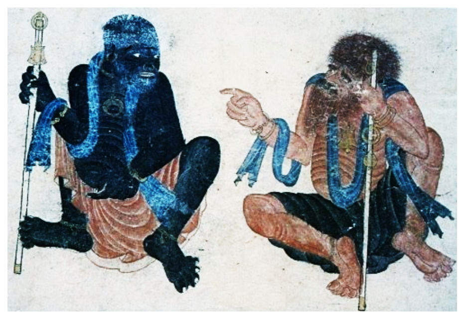
Figure 3 . Miniature entitled Two Dervishes having a conversation, attributed to Mehmed Siyah Qalam (Roxburgh, 2005)

The theories that the grotesque demon (satan) figures we see in the paintings of the Mehmed Siyah Qalam represent the Sufis are a topic of discussion that remains up to date. These grotesque and terrible images uploaded to the Sufis can be presented as evidence of the tense political conflicts of the period.