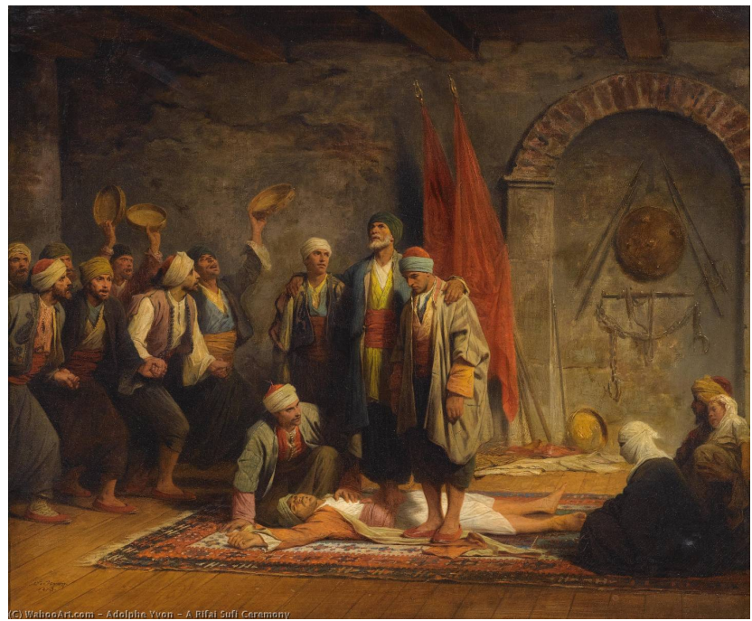
Figure 12. Rüfai Ceremony, oil on canvas, 46.4 x 55.5 cm, (Yvon, 1879)