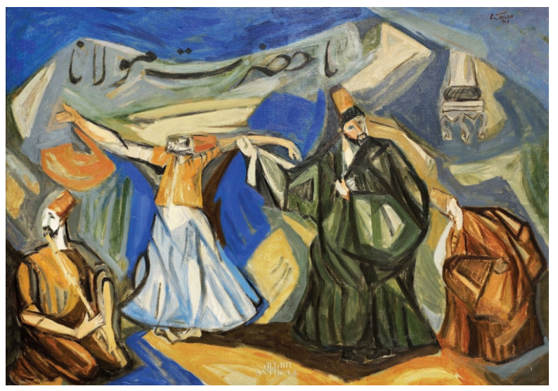
Figure 22. Mevlevis, oil on canvas, 75 x 100 cm, (Tollu, Mevleviler, 1968)

Cubist forms are distinctive features in 3 paintings by Cemal Tollu depicting the Mevlevis. In the horizontal canvas dated 1968, the Arabic inscription 'Hazrat Mevlana' attracts wievers attention. In another canvas whose date is unknown (Tollu, Mevleviler, t.y.), a whirling dervish fills the space at the top of the composition alone. In Tollu's 1958 painting The Mevlevis, whirling dervish is depicted as a butterfly emerging from a cocoon. The blue color that dominates the painting carries a feeling of peace, happiness and serenity. This deep blue emptiness represents an unknown and unrecognizable (noumenon) space. In the work, metaphysical and mystical thoughts are depicted without conflicting with each other. Tollu did not prefer the documentarian reflexes of his predecessor painters but brought the supersensible things of Sufism into the subject of the painting. This is the sensitivity that places Cemal Tollu in a different position among the works of painting on the subject of the Mevlevis.