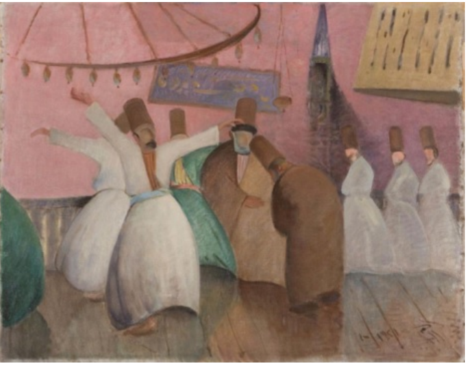
Figure 17. Mevlevis, oil on canvas, 65 x 81 cm, 1921, (Güler, 2014)

The Mevlevi Lodges and other tekkes closed in 1925 by the new Turkish Republic' laws. The sema ceremony of start up again in the 1950s with the interest in the subject of painters comes alive again. Painters such as Maide Arel, Aliye Berger, Ruzin Gerçin, Mümtaz Yener, Cevat Dereli, Fahrelnisa Zeid and Fikret Otyam have created unique