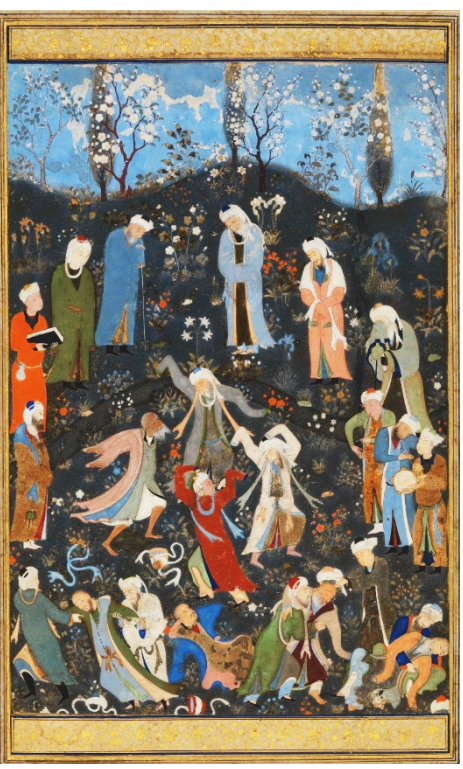
Figure 2. Miniature titled Dancing Dervishes attributed to Master Kamāl ud-Dīn Behzād from the Hafiz Divan, Iran, 1480, (Metmuseum, 2024)

"Given the significant social roles of Sufis in the fifteenth century, it is reasonable for them to be reflected in the paintings. It is also worth considering that other theories about the time range in which Siyah Qalam's paintings were produced most often coincide in the fifteenth century." (Shams and Farrokhfar, 2020, p.110)