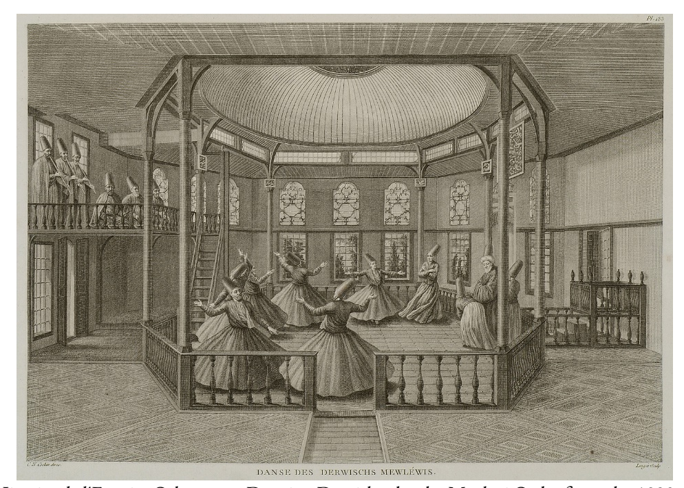
Figure 10. Histoire de l'Empire Othomane, Dancing Dervishes by the Mevlevi Order from the 1820 edition of the book, (Laskaridis Foundation, 2014)