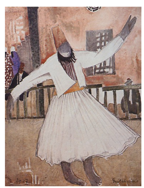
Figure 15. Whirling Dervish, watercolor on paper, (Gritchenko, 1920)