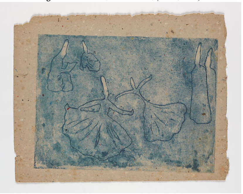
Figure 20 . Mevlevi, printmaking, 31,1 x 38,7 cm, (Berger, 1960)