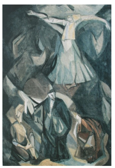
Figure 23. Mevlevis, oil on canvas, no size information, (Tollu, Mevlevis, t.y.)