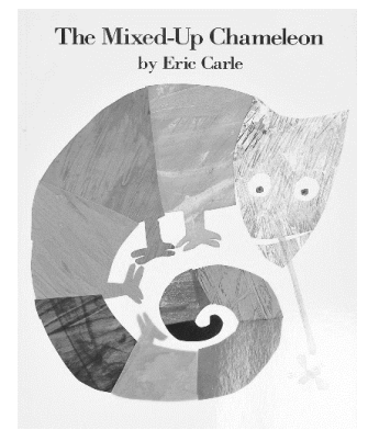
Figure 2. The Mixed-up Chameleon (Eric Carle)