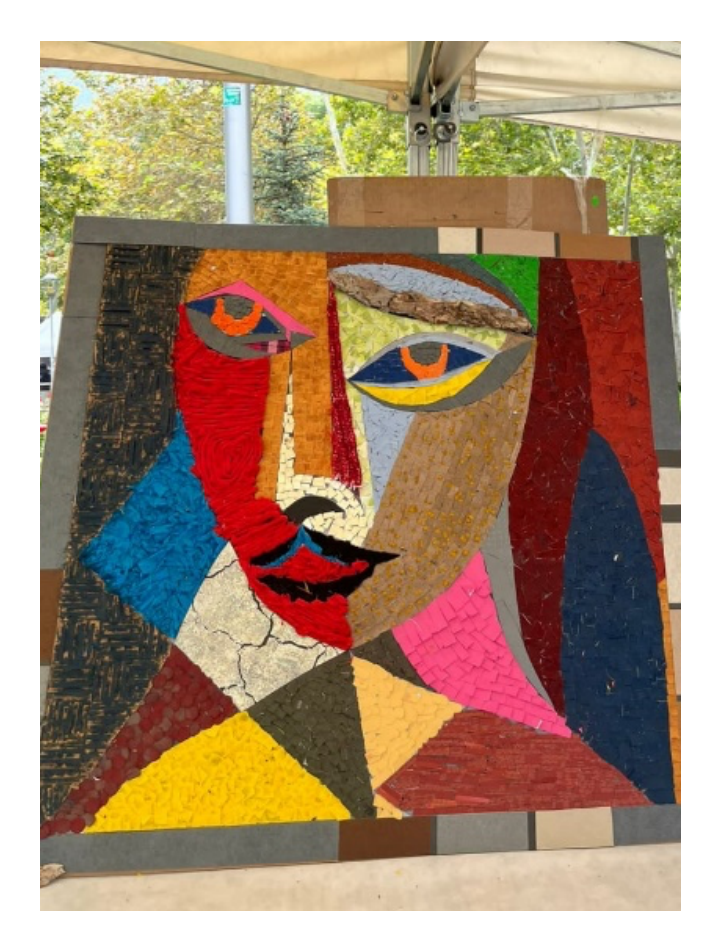
Figure 4. The final product (artwork)