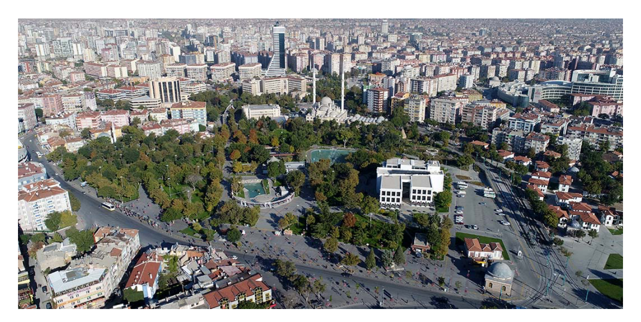
Figure 2 . Workshop space Kültürpark (Url-2)

Upcycling refers to the reshaping of an old, waste, or useless object in order to make it usable. Many materials, such as broken, worn-out items and unusable clothes, can be used for upcycling. In a sense, this can be seen as giving the product a second chance and allowing it to continue its life in a different form. In this context, the "Second Chance: Upcycling" workshop, held within the scope of the festival, emerged. In the workshop, students were given information about upcycling, and a creative discussion environment was created on the subject (Figures 3). Afterward, a pre-determined art product was reproduced within the scope of the workshop with the waste materials that the students had previously collected from their environment and the waste materials collected from the festival area. In this context, cardboard pieces, old material catalogs, plastic bottle caps, spilled tree barks, discarded festival posters were cut in small sizes and glued to the relevant areas to create a visual texture effect in the study. In this context, no new materials were used for the study, all the elements that formed the design were obtained from waste materials that have completed their existing functions.