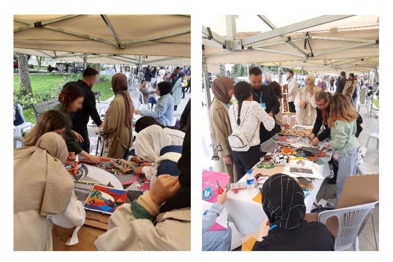
Figure 3. Images from the workshop environment

In the production of the artwork, the design was carried out in line with the elements and principles learned in the Basic Design course, which is a course taught in the first year of the architecture school. Thus, the lesson learned in theory was reinforced practically in an informal environment with the theme of upcycling. The final product is shown in Figure 4.