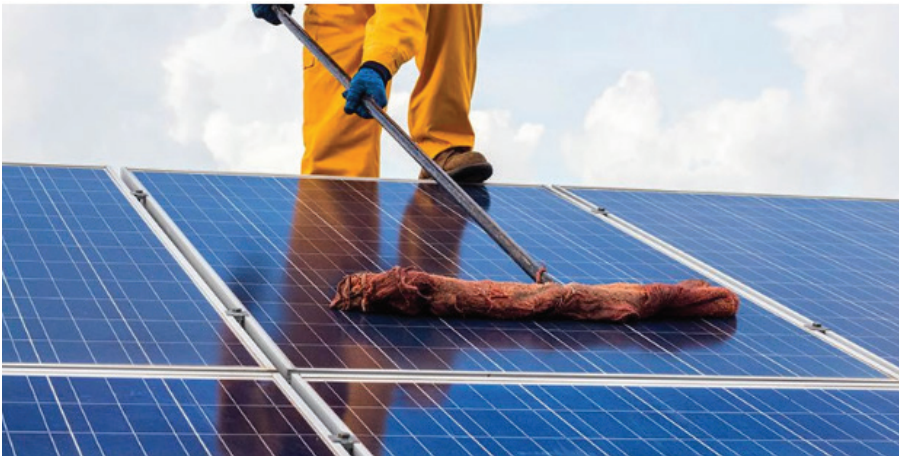
Figure 3. Manually cleaning PV modules.

holistic solutions that ensure the longevity and efficiency of solar energy systems.