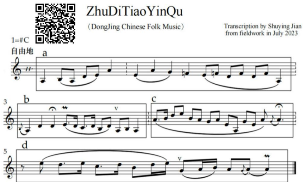
Score 1. ZhuDiTiao YinQu music score.

Melody Patterns: The melody patterns in Dongjing music are often complex and layered, with interweaving lines that reflect the music's ceremonial and ritualistic functions. These patterns are designed to complement the scales, creating a harmonious and balanced sound that resonates with the cultural and spiritual significance of the music, as shown in Score 1.