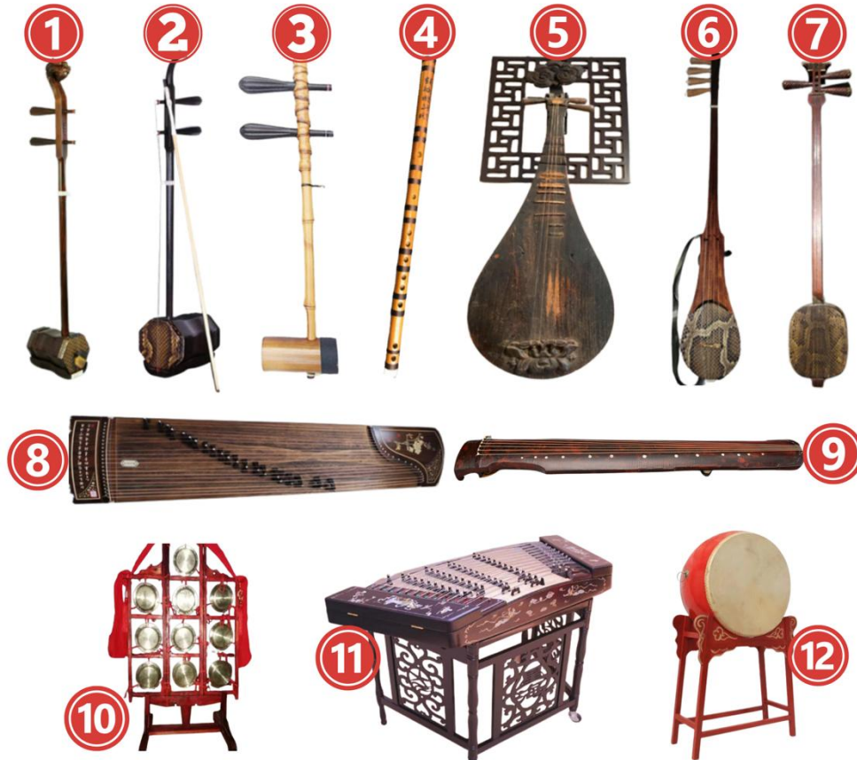
Figure 2. Dongjing Chinese folk musical instruments.

Figure 2, each instrument plays a specific role, whether melodic, harmonic, or rhythmic, contributing to the ensemble's overall balance and depth. The diverse range of timbres and tonalities these instruments provide reflects the rich cultural and spiritual dimensions of Dongjing music. The figure enhances understanding by visually presenting the ensemble's components, allowing readers to connect the textual descriptions with visual representations.