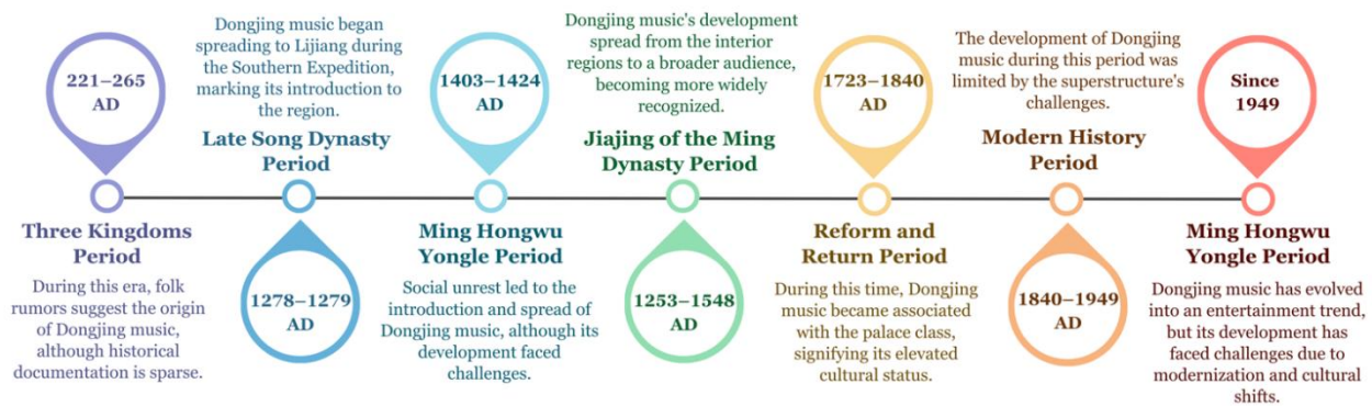
Figure 1. Historical development timeline.

current status in the modern era, Dongjing music has continually evolved, influenced by each period's socio-political and cultural forces. Understanding this historical trajectory is crucial for appreciating the music's current challenges and opportunities, particularly in preservation and transmission efforts in Lijiang and beyond. The continued study and documentation of Dongjing music help safeguard this cultural heritage and ensure it remains a vibrant and relevant part of China's cultural landscape, as shown in Figure 1.