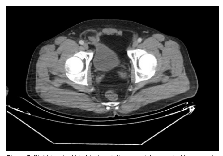
Figure 2. Right inguinal bladder herniation on axial computed tomography images