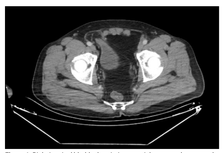
Figure 1. Right inguinal bladder herniation on axial computed tomography images