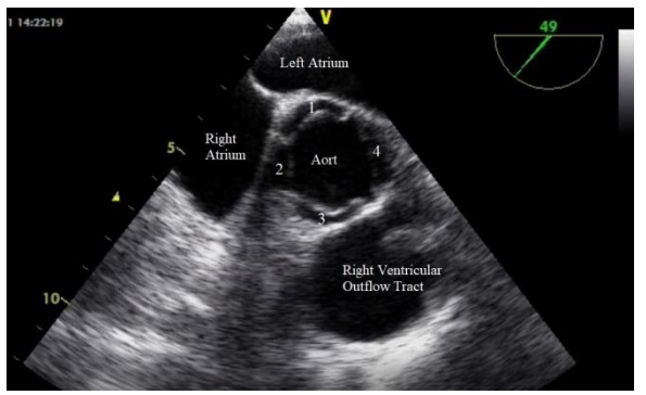
Figure 2. See Figure 5.

preserved valve opening motion pattern and moderate AR (Figure 3). Antibiotic prophylaxis for infective endocarditis (IE) and annual follow for AR were recommended to the patient.