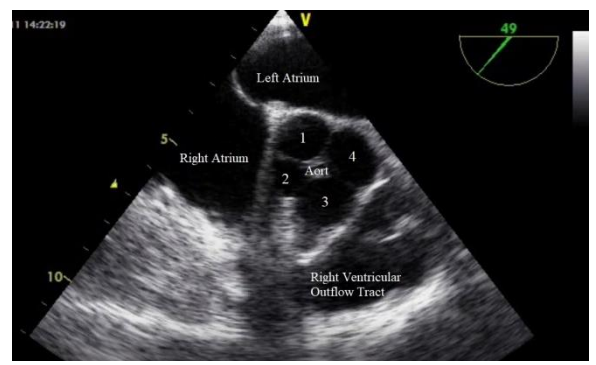
Figure 1. See Figure 5.

temperature of 37, 5°C, blood pressure of 140/70 mmHg, heart rate of 90 beats/min, and respiratory rate 18 breaths/min, with an oxygen saturation of 98% on room air. There was no any abnormality on physical examination apart from 4/6 diastolic murmur along the left sternal border. An electrocardiogram showed left ventricular high voltage in addition to mild upsloping ST segment depression in V5 and V6 leads. The chest radiogram showed normal findings.