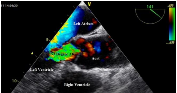
Figure 4. See Figure 5.