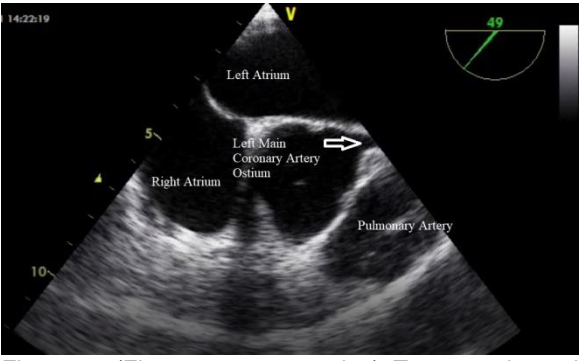
Figure 5. (Figures 1, 2, 4 and 5) Transesophageal echocardiography showing an aortic valve with four

cusps, and left and right coronary artery ostium [left coronary cusp (4, LCC), right coronary cusp (3, RCC), non-coronary cusp (1, NCC) and accessory cusp (2, AC)].