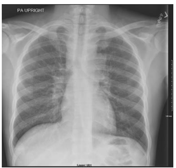
Figure 1- Chest X-Ray showing left-sided mass seen in relation to the aorticopulmonary window.

were performed with biopsy. The frozen section revealed no malignant cells. Final pathology result reported granulomatous lymphadenitis with necrosis. The acid-fast stain was positive for abundant mycobacterial organisms. The fungal stain was negative. The patient was put in airborne isolation, and three sputum AFB smears were obtained which was reported as Mycobacterium Four species. drugs antituberculous treatment was initiated. At this time concern for HIV was raised and HIV tests were sent. To our surprise, HIV 1 antibody came back positive with HIV viral load of 2,060,000 and a CD4 count of 55. The patient was asked again about his sexual health, and he answered that he was sexually active with multiple female partners in last 1-2 years and never used a condom. HIV P24 antigen was non-reactive. Hepatitis B and C testing were also negative. The patient was transitioned to Lovenox and finally to Apixaban for the pulmonary embolism. As mentioned earlier, antitubercular therapy with four medications was started before the HIV diagnosis. Later patient was transferred to an Infectious Disease specialized hospital for initiation of HIV treatment.