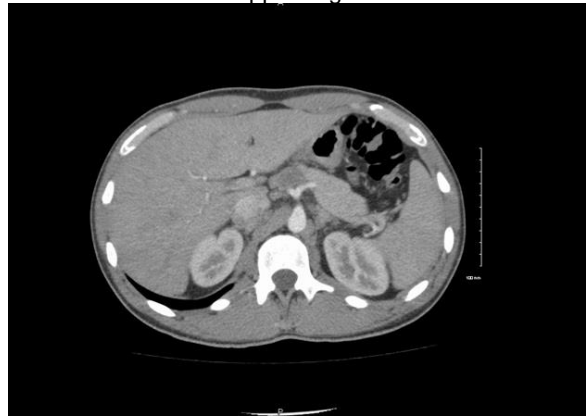
Figure 2c. The included upper abdomen demonstrates multiple small hypodense splenic lesions and a 2.5x1.8x1.8 cm hypodense mass centered at the bifurcation of the celiac artery and indenting the superior portion of the proximal pancreatic body.

to Apixaban 10 mg p.o. twice daily for the pulmonary embolism. He was transferred to