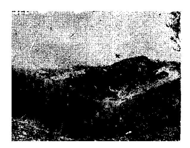
Fig. 3 The basin of fig. 1, seen in westernly direction, k is limestone.

The water can flow in the limestones only in western direction, towards