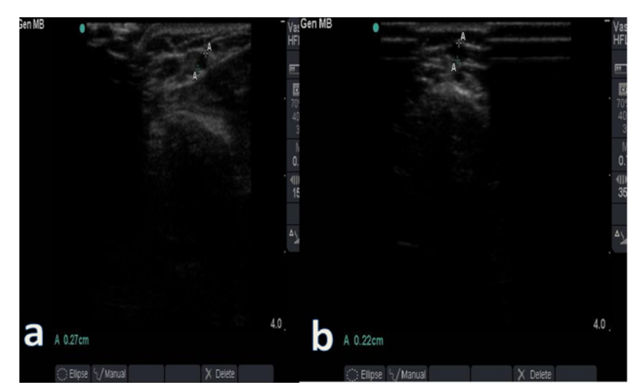
Figure 1. Measurement diameter of vessels by DUS. Radial artery (a) and cephalic vein (b). DUS = Doppler ultrasonography

Detection of murmur by auscultation and existence of thrill by palpation were assessed as a successful AVF procedure just after the procedure and at day 1. Thrill was controlled in the patients during the control visits at day 10, months 1, 3, 6 and 12. The patients were taken into hemodialysis sessions at day 2. A successful AVF procedure was considered as implementation of a 4-hour hemodialysis through a 16